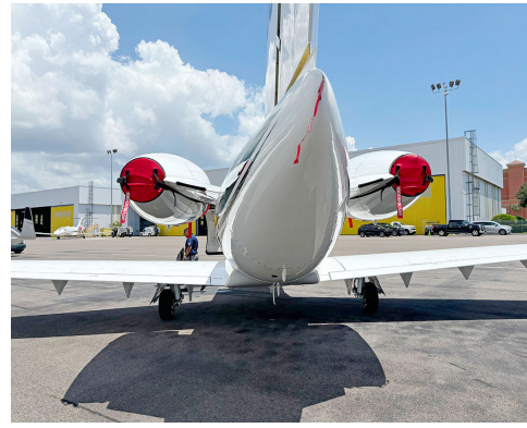
Cessna Citation 560XL Upper Nacelle/Brightwork Covers Cessna Citationjet 525C, CJ-4 Engine Inlet Covers & Exhaust Plugs