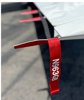
Cessna Citationjet 525C, CJ-4 Static Wick Protectors, 3 Per Wing, 1 On Tailcone Area