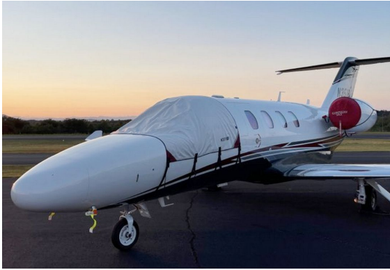
Cessna Citation Jet 525 Cockpit Cover

This cover type is made from Silver Acrylic Sunbrella canvas and is 100% lined with a soft and smooth microfiber. Bruce's Custom Covers developed this material combination especially for aircraft protection. The outer material is medium weight and treated for water resistance, UV resistance and anti-static buildup. The inner lining is a very soft and smooth microfiber to prevent scratching. The material is very reflective, and tests show that the cabin interior temperature can be reduced to near-ambient temperature on the hottest of days. It is water, ice and snow repellent, yet breathable to allow moisture to escape from between the cover and the aircraft surface.