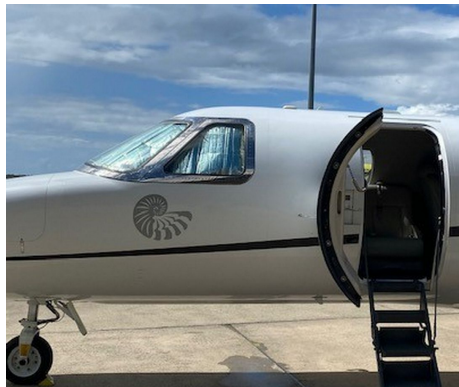
Cessna Citationjet CJ2 Cockpit HeatShields

Cockpit Heatshields are interior sunshades for the aircraft's cockpit. The product is a unique composite of closed-cell foam with a silver mylar finish. The semi-rigid design is stiff enough to stand inside the window framing. The set folds up flat and is easily stored in the included storage sleeve. Some designs may require velcro and suction cups. Our Heatshields for jets are offered white side out because some aircraft manufacturers have issued advisories against reflective window inserts due to potential heat damage. A Heatshield is an excellent short-term remedy for cockpit overheating, but an external fabric cover is more effective for long-term protection.