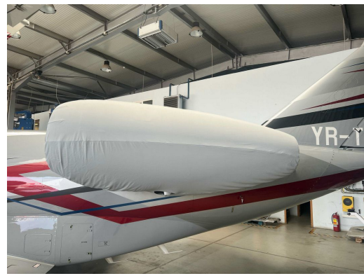
Cessna Citation 560XL Upper Nacelle/Brightwork Covers Citationjet 525C, CJ4, Complete Nacelle Cover, light weight Spandex