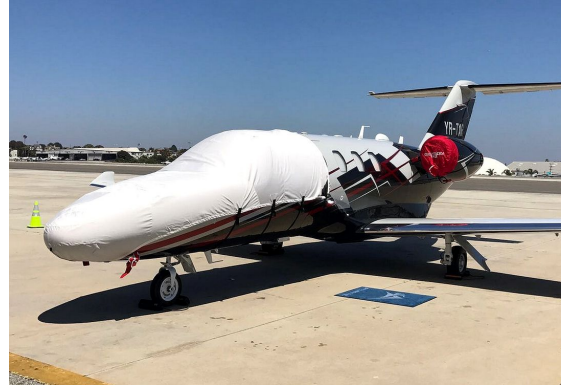
Citationjet CJ1 Cockpit/Nose Cover