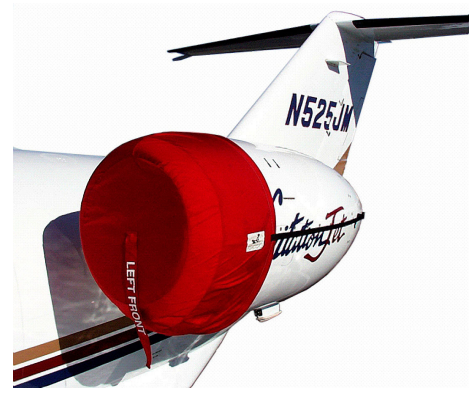
Engine Inlet Cover