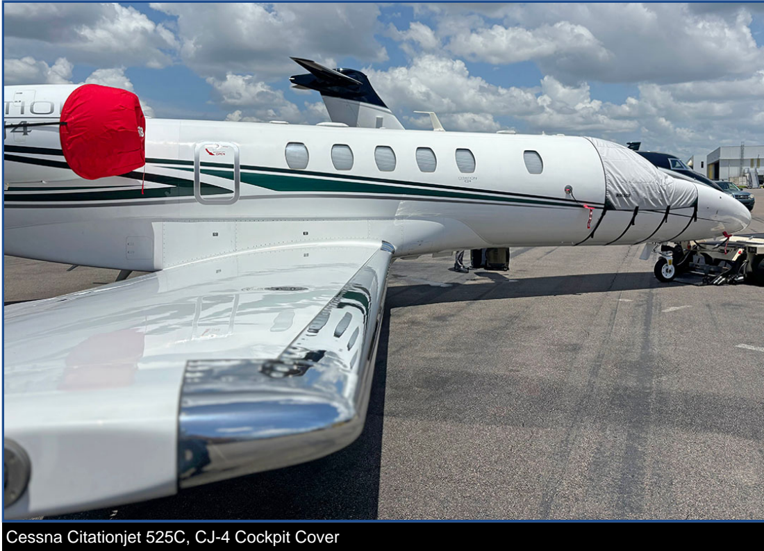
Cessna Citationjet 525C, CJ-4 Cockpit Cover