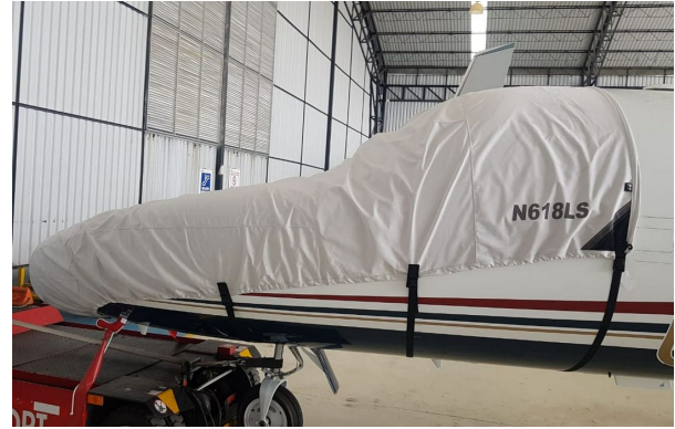
Citationjet 525B Cockpit/Nose Cover