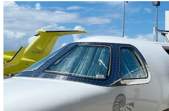
Cessna Citationjet CJ2 Cockpit HeatShields