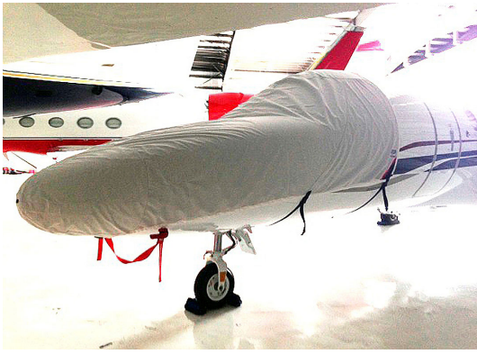
Citation CJ4 Cockpit/Nose Cover and Heat Resistant Pitot Covers set