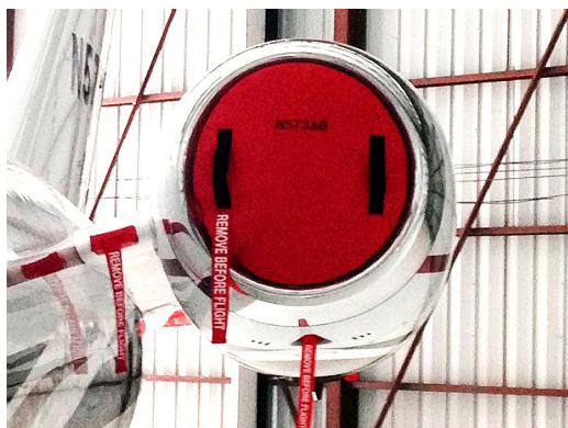
Citation CJ4 Intake Plugs pair