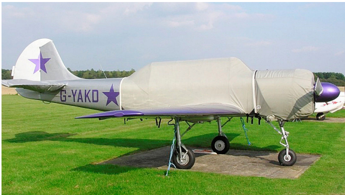
Yak 52 Extended Canopy, Engine & Horiz. Stab. Covers