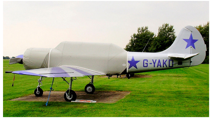
Yak 52 Extended Canopy, Engine & Horiz. Stab. Covers