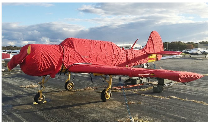
Yak 52 Full Cover Set