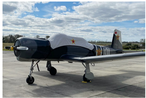
CJ-6 with Malcomb Hood