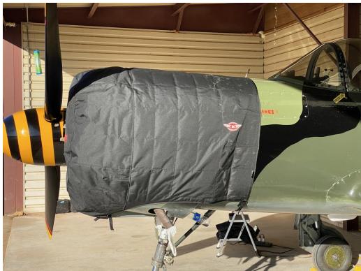
Nanchang CJ6 Insulated Engine Cover

The material is very reflective, and tests show that the cabin interior temperature can be reduced to near-ambient temperature on the hottest of days. It is water, ice and snow repellent, yet breathable to allow moisture to escape from between the cover and the aircraft surface.