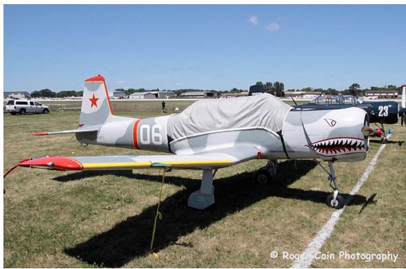
CJ-6 Nanchang Canopy Cover