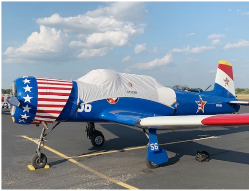
Nanchang CJ-6 Canopy Cover for Malcolm Hood