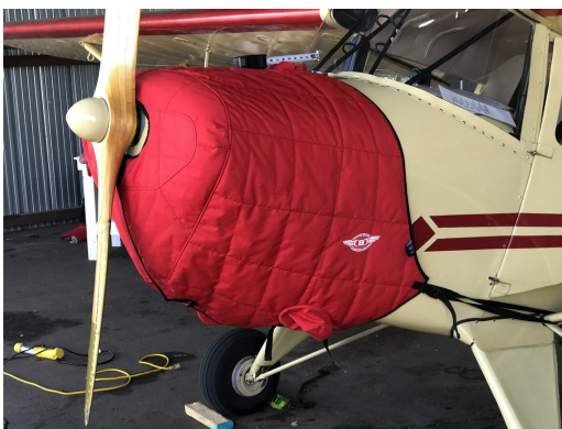
Taylorcraft Insulated Engine Cover

This cover type is made from Silver Acrylic Sunbrella canvas and is 100% lined with a soft and smooth microfiber. Bruce's Custom Covers developed this material combination especially for aircraft protection. The outer material is medium weight and treated for water resistance, UV resistance and anti-static buildup. The inner lining is a very soft and smooth microfiber to prevent scratching. The material is very reflective, and tests show that the cabin interior temperature can be reduced to near-ambient temperature on the hottest of days. It is water, ice and snow repellent, yet breathable to allow moisture to escape from between the cover and the aircraft surface.