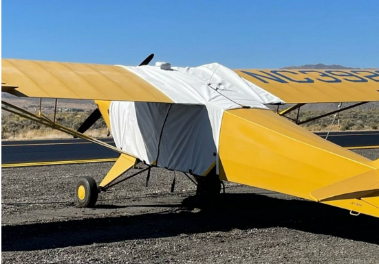
Taylorcraft BC-12D Extended Canopy Cover

This cover type is made from Silver Acrylic Sunbrella canvas and is 100% lined with a soft and smooth microfiber. Bruce's Custom Covers developed this material combination especially for aircraft protection. The outer material is medium weight and treated for water resistance, UV resistance and anti-static buildup. The inner lining is a very soft and smooth microfiber to prevent scratching. The material is very reflective, and tests show that the cabin interior temperature can be reduced to near-ambient temperature on the hottest of days. It is water, ice and snow repellent, yet breathable to allow moisture to escape from between the cover and the aircraft surface.