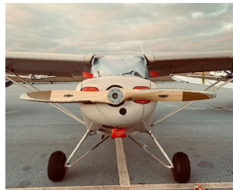
Taylorcraft Engine Inlet Plugs