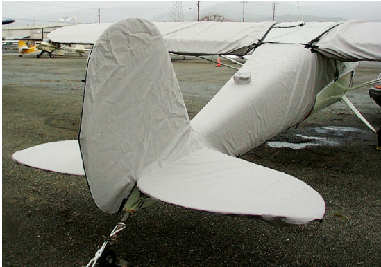
Cessna 120 Empennage Cover

WINTER USE MATERIAL - Made with Solution-Dyed Polyester fabric, this option is intended for seasonal use to aid in deicing, rain mitigation, or for occasional travel. The material is lighter and more compact, but more susceptible to UV damage and may have a shorter useful life if used continuously outside than the all-year use material.