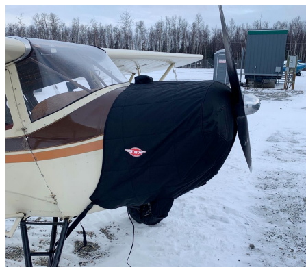
Taylorcraft Insulated Engine Cover