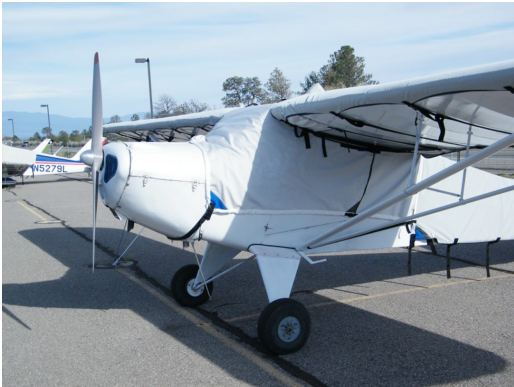
Taylorcraft Over-Top Canopy Cover & Wing Covers

WINTER USE MATERIAL - Made with Solution-Dyed Polyester fabric, this option is intended for seasonal use to aid in deicing, rain mitigation, or for occasional travel. The material is lighter and more compact, but more susceptible to UV damage and may have a shorter useful life if used continuously outside than the all-year use material.