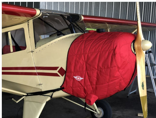
Taylorcraft Insulated Engine Cover

This cover type is made from Silver Acrylic Sunbrella canvas and is 100% lined with a soft and smooth microfiber. Bruce's Custom Covers developed this material combination especially for aircraft protection. The outer material is medium weight and treated for water resistance, UV resistance and anti-static buildup. The inner lining is a very soft and smooth microfiber to prevent scratching. The material is very reflective, and tests show that the cabin interior temperature can be reduced to near-ambient temperature on the hottest of days. It is water, ice and snow repellent, yet breathable to allow moisture to escape from between the cover and the aircraft surface.