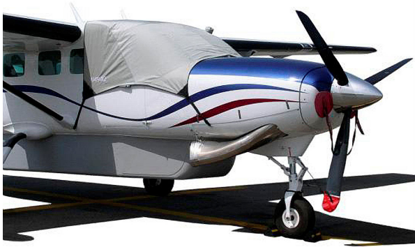
Cessna Caravan Cockpit Cover, Plugs, Prop Ties & Pitot Cover

water resistance, UV resistance and anti-static buildup. The inner lining is a very soft and smooth microfiber to prevent scratching. The material is very reflective, and tests show that the cabin interior temperature can be reduced to near-ambient temperature on the hottest of days. It is water, ice and snow repellent, yet breathable to allow moisture to escape from between the cover and the aircraft surface.