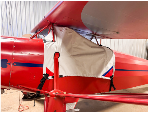
Corben Baby Ace, Junior Ace, and similar models Cockpit Cover