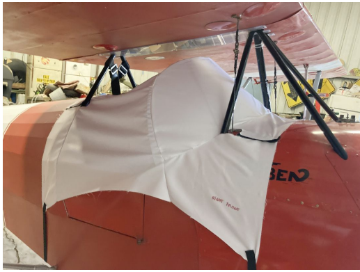
Corben Junior Ace Cockpit Cover, test fit cover