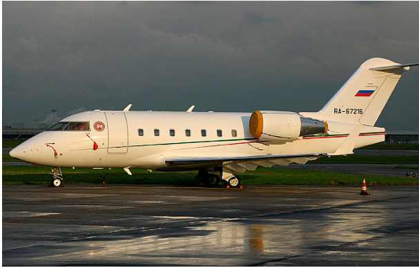
Challenger 604 Intake Covers, OEM design

The Canadair Regional Jet 200, 700 Bikini Style Engine Covers are a single-piece design using a soft and smooth stretchy and fabric. The cover stretches tightly over both the intake and exhaust, installing quickly and easily. These covers are designed to be used as hangar dust covers and have a useful life of approximately one year.