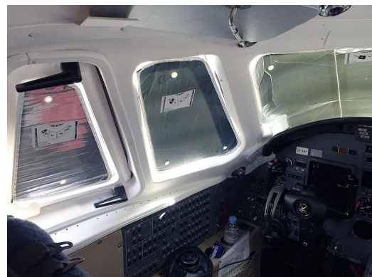
Cessna Citation XL, XLS (560XL) Cockpit Heatshields