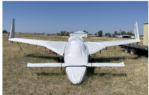
Cozy Mk IV Complete Cover Set