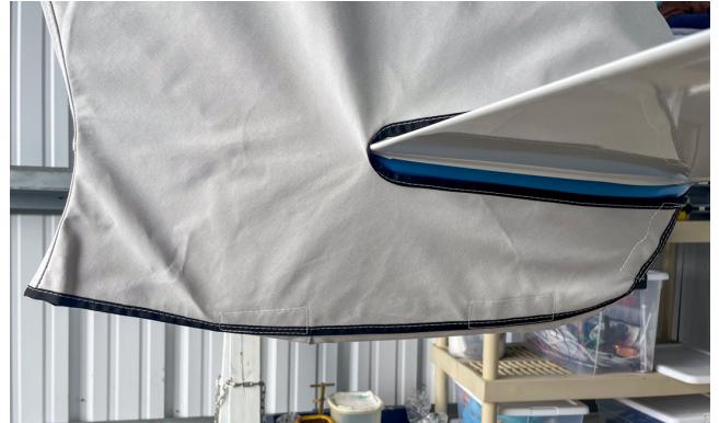
Cozy All Models Vertical Stabilizer Covers, All Year Use