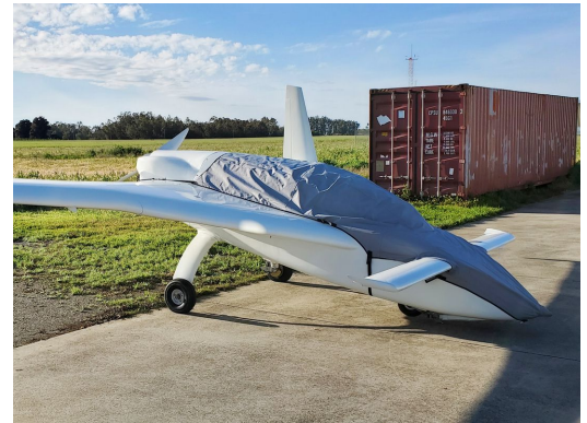
Cozy Travel Weight Canopy/Nose Cover