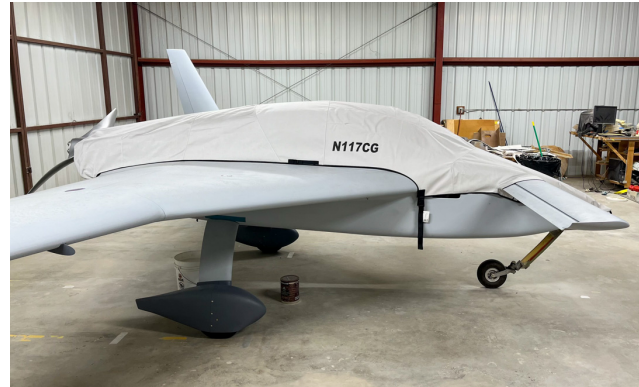
Cozy All Models Canopy/Nose/Engine Cover, Mark Iii & Iv Models