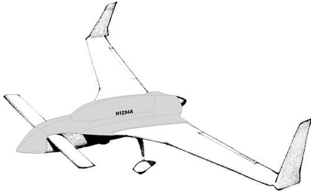
Rutan Long-EZ Canopy Cover

water resistance, UV resistance and anti-static buildup. The inner lining is a very soft and smooth microfiber to prevent scratching. The material is very reflective, and tests show that the cabin interior temperature can be reduced to near-ambient temperature on the hottest of days. It is water, ice and snow repellent, yet breathable to allow moisture to escape from between the cover and the aircraft surface.