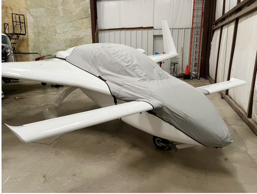
Cozy Mk IV Canopy/Nose Cover, travel weight

water resistance, UV resistance and anti-static buildup. The inner lining is a very soft and smooth microfiber to prevent scratching. The material is very reflective, and tests show that the cabin interior temperature can be reduced to near-ambient temperature on the hottest of days. It is water, ice and snow repellent, yet breathable to allow moisture to escape from between the cover and the aircraft surface.