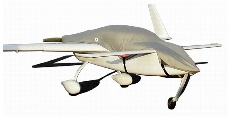
Cozy III Canopy/Nose/Engine Cover