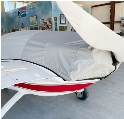
Cozy Mk IV Canopy/Nose/Engine Cover, travel weight design

Travel Covers are made with Silver Solution-Dyed Polyester fabric and only lined over the windshield to save weight. The material is lightweight and more compact for easy stowage in the aircraft. The polyester material is water resistant, but only intended for occasional use outside. We also have an ultra lightweight material available for fitted hangar dust covers. For daily outdoor use, the non-travel Sunbrella Cover is the best choice.