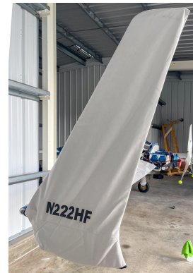
Cozy All Models Vertical Stabilizer Covers, All Year Use