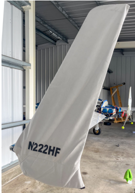
Cozy All Models Vertical Stabilizer Covers, All Year Use