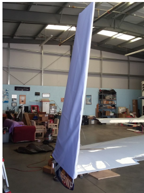
Velocity Vertical Stabilizer Covers, test fit cover

WINTER USE MATERIAL - Made with Solution-Dyed Polyester fabric, this option is intended for seasonal use to aid in deicing, rain mitigation, or for occasional travel. The material is lighter and more compact, but more susceptible to UV damage and may have a shorter useful life if used continuously outside than the all-year use material.