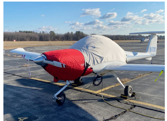
DA-20 Canopy/Engine, Prop/Spinner, Wing, Tailboom, Horiz. Stab. Covers Diamond DA20-C1 Insulated Engine Cover, C1 models