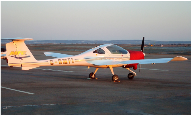
Diamond DA-20 Insulated Engine Cover

This cover type is made from Silver Acrylic Sunbrella canvas and is 100% lined with a soft and smooth microfiber. Bruce's Custom Covers developed this material combination especially for aircraft protection. The outer material is medium weight and treated for water resistance, UV resistance and anti-static buildup. The inner lining is a very soft and smooth microfiber to prevent scratching. The material is very reflective, and tests show that the cabin interior temperature can be reduced to near-ambient temperature on the hottest of days. It is water, ice and snow repellent, yet breathable to allow moisture to escape from between the cover and the aircraft surface.