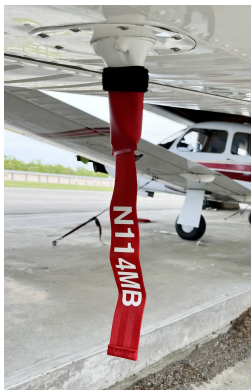
Blade-type Pitot Cover

Engine Inlet Plugs are custom fit for your Diamond DA-20, Katana, Eclipse intakes, made with heavy-duty vinyl material, and stuffed with a single block of sculpted urethane foam. Each plug has a zipper that allows the foam to be removed and dried if necessary. Engine plugs have warning flags that are visible from the cockpit or 'remove before flight' streamers sewn onto the face of the plugs. Most plugs are imprinted with the aircraft registration number in black for an extra charge. Storage bag NOT included. Engine plugs may be inserted after flight when the engine is still warm. Engine Inlet Plugs are commonly referred to as Cowl Plugs, Intake Plugs, Cowl Blocks, Engine Blocks, and Engine Bungs.