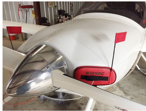
Diamond DA-20-C1 Engine Inlet Plugs