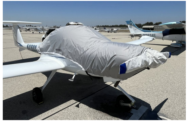
DA-20 Canopy/Engine, Prop/Spinner, Wing, Tailboom, Horiz. Stab. Covers Diamond DA-20 Canopy/Engine Cover (Travel Weight), Prop Cover