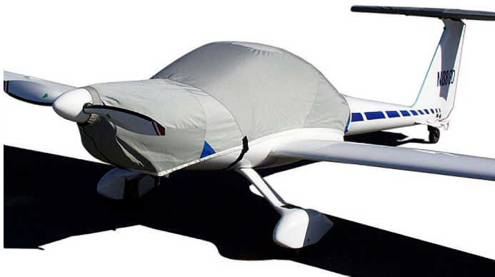
Diamond DA-20 Canopy/Engine Cover

This cover type is made from Silver Acrylic Sunbrella canvas and is 100% lined with a soft and smooth microfiber. Bruce's Custom Covers developed this material combination especially for aircraft protection. The outer material is medium weight and treated for water resistance, UV resistance and anti-static buildup. The inner lining is a very soft and smooth microfiber to prevent scratching. The material is very reflective, and tests show that the cabin interior temperature can be reduced to near-ambient temperature on the hottest of days. It is water, ice and snow repellent, yet breathable to allow moisture to escape from between the cover and the aircraft surface.