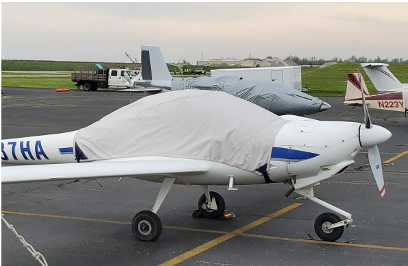
Diamond DA-20 Katana