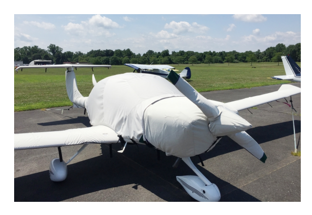
Diamond DA-40 Extended Canopy, Wing, Engine, Prop, Empennage & Horiz. Stab Covers