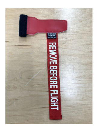
Pitot Tube Cover