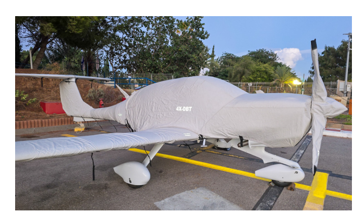
Diamond DA-40 Complete Cover Set