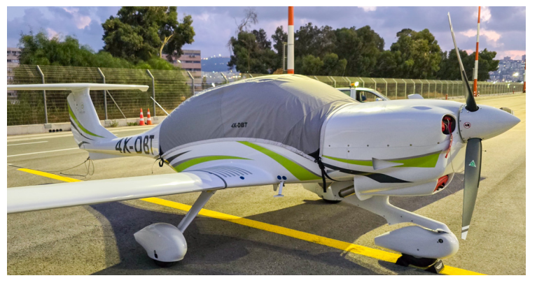
Model (Aft Scoop Ext.)