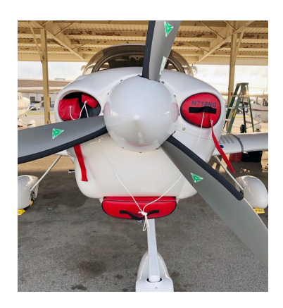
Diamond DA-40 Engine Plugs, Ng Model