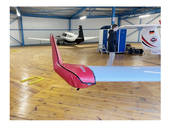
Diamond DA-40 Wingtip Pads