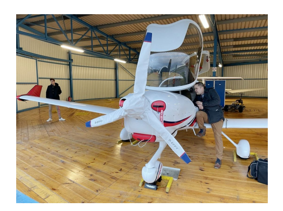
DA40 NG Engine Plugs

Designed to prevent damage to the aircraft extremities in crowded hangars, these products are made of bright red Naugahyde and thickly padded with a sandwich of closed cell foam.