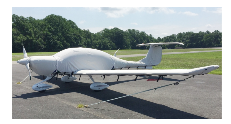
Diamond DA-40 Extended Canopy, Wing, Engine, Prop, Empennage & Horiz. Stab Covers

WINTER USE MATERIAL - Made with Solution-Dyed Polyester fabric, this option is intended for seasonal use to aid in deicing, rain mitigation, or for occasional travel. The material is lighter and more compact, but more susceptible to UV damage and may have a shorter useful life if used continuously outside than the all-year use material.