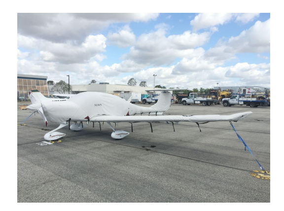
Diamond DA-40 Full Cover Set

This cover type is made from Silver Acrylic Sunbrella canvas and is 100% lined with a soft and smooth microfiber. Bruce's Custom Covers developed this material combination especially for aircraft protection. The outer material is medium weight and treated for water resistance, UV resistance and anti-static buildup. The inner lining is a very soft and smooth microfiber to prevent scratching. The material is very reflective, and tests show that the cabin interior temperature can be reduced to near-ambient temperature on the hottest of days. It is water, ice and snow repellent, yet breathable to allow moisture to escape from between the cover and the aircraft surface.