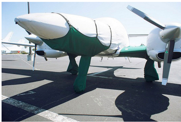
Diamond DA-42 Twinstar Landing Gear & Gearwell Covers