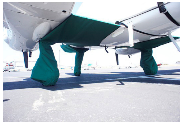
Twinstar Landing Gear & Gearwell Covers