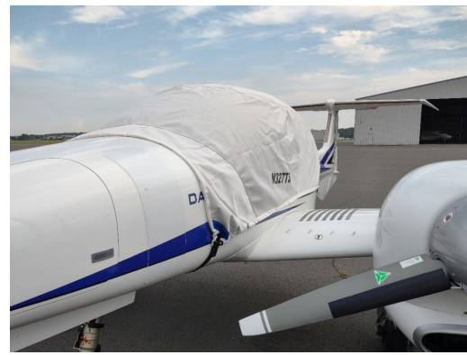
Diamond DA-42 Twin Star Canopy Cover