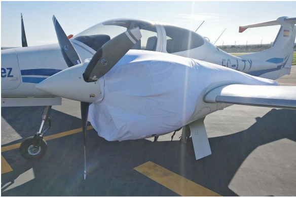
DA42 MPP Guardian (DA42-NG) Engine Cover, test fit cover