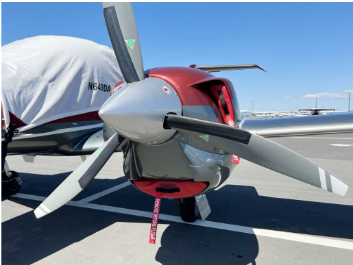
Diamond DA-42 Engine Inlet Plugs