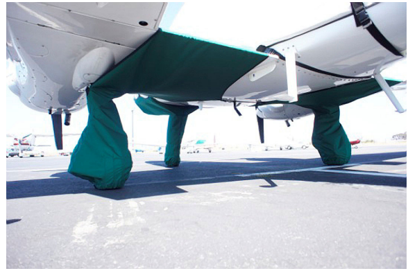
Twinstar Landing Gear & Gearwell Covers