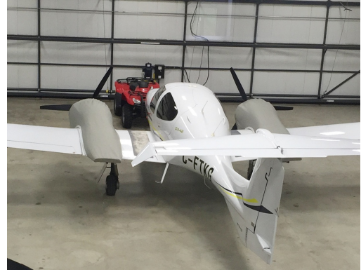
Diamond DA-42 Twinstar Engine Covers