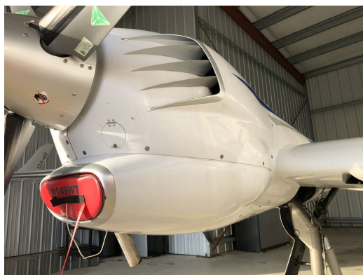
Diamond DA-42 Engine Inlet Plugs

Engine Inlet Plugs are custom fit for your Diamond DA-42 Twin Star intakes, made with heavy-duty vinyl material, and stuffed with a single block of sculpted urethane foam. Each plug has a zipper that allows the foam to be removed and dried if necessary. Engine plugs have warning flags that are visible from the cockpit or 'remove before flight' streamers sewn onto the face of the plugs. Most plugs are imprinted with the aircraft registration number in black for an extra charge. Storage bag NOT included. Engine plugs may be inserted after flight when the engine is still warm. Engine Inlet Plugs are commonly referred to as Cowl Plugs, Intake Plugs, Cowl Blocks, Engine Blocks, and Engine Bungs.