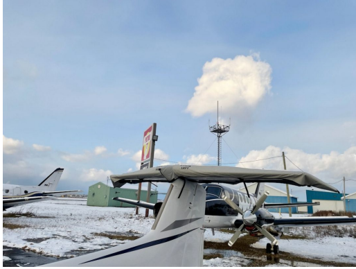
Diamond DA-42 Horizontal Stabilizer Cover

WINTER USE MATERIAL - Made with Solution-Dyed Polyester fabric, this option is intended for seasonal use to aid in deicing, rain mitigation, or for occasional travel. The material is lighter and more compact, but more susceptible to UV damage and may have a shorter useful life if used continuously outside than the all-year use material.