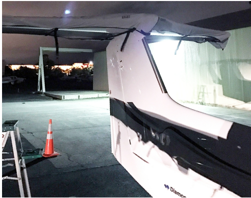
Diamond DA-42 Twin Star Wing & Engine Covers