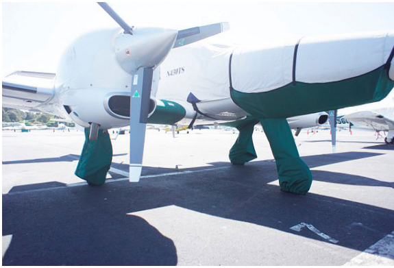
Twinstar Landing Gear & Gearwell Covers