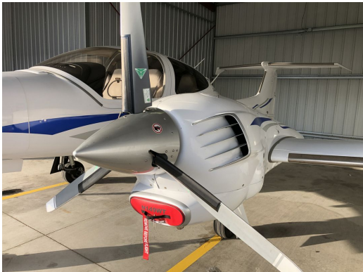
Diamond DA-42 Engine Inlet Plugs

Engine Inlet Plugs are custom fit for your Diamond DA-42 Twin Star intakes, made with heavy-duty vinyl material, and stuffed with a single block of sculpted urethane foam. Each plug has a zipper that allows the foam to be removed and dried if necessary. Engine plugs have warning flags that are visible from the cockpit or 'remove before flight' streamers sewn onto the face of the plugs. Most plugs are imprinted with the aircraft registration number in black for an extra charge. Storage bag NOT included. Engine plugs may be inserted after flight when the engine is still warm. Engine Inlet Plugs are commonly referred to as Cowl Plugs, Intake Plugs, Cowl Blocks, Engine Blocks, and Engine Bungs.