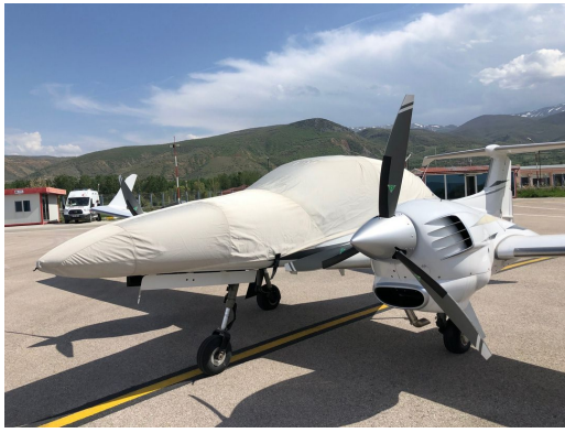
Diamond DA-42 Canopy/Nose Cover