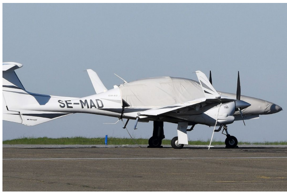
DA-42 Canopy/Nose Cover