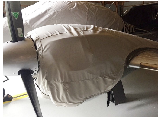
Diamond DA42-VI Canopy/Nose Cover