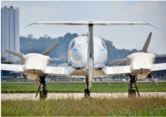
Diamond DA-42NG Engine & Prop Covers

The material is very reflective, and tests show that the cabin interior temperature can be reduced to near-ambient temperature on the hottest of days. It is water, ice and snow repellent, yet breathable to allow moisture to escape from between the cover and the aircraft surface.