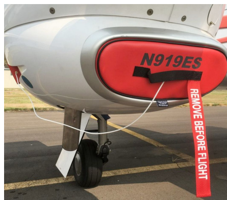
Diamond Da-42 Engine Inlet Plugs Set of 4