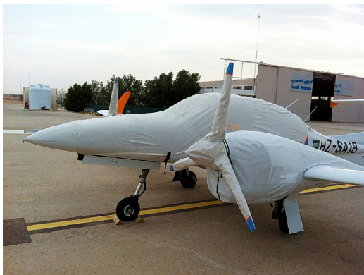
Diamond DA-42NG Canopy/Nose, Engine & Prop Covers

The material is very reflective, and tests show that the cabin interior temperature can be reduced to near-ambient temperature on the hottest of days. It is water, ice and snow repellent, yet breathable to allow moisture to escape from between the cover and the aircraft surface.