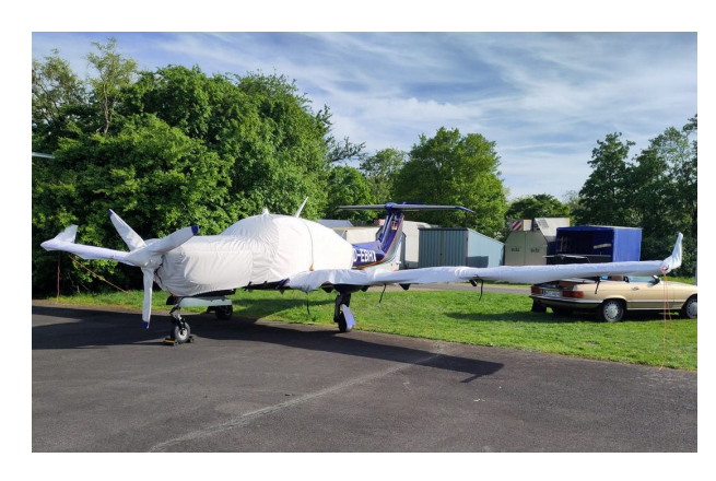
Diamond DA-50 Extended Canopy/Engine, Prop & Wing Covers Diamond DA-50 Extended Canopy/Engine, Prop & Wing Covers (test fit) (test fit)