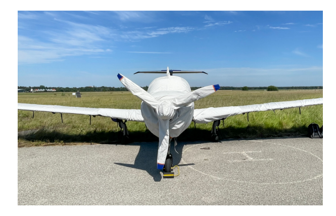
Diamond DA-50 Extended Canopy/Engine Cover, Wing & Prop Covers

This cover type is made from Silver Acrylic Sunbrella canvas and is 100% lined with a soft and smooth microfiber. Bruce's Custom Covers developed this material combination especially for aircraft protection. The outer material is medium weight and treated for water resistance, UV resistance and anti-static buildup. The inner lining is a very soft and smooth microfiber to prevent scratching. The material is very reflective, and tests show that the cabin interior temperature can be reduced to near-ambient temperature on the hottest of days. It is water, ice and snow repellent, yet breathable to allow moisture to escape from between the cover and the aircraft surface.