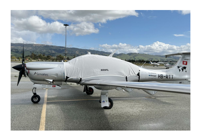
Diamond DA-50 Canopy Cover

This cover type is made from Silver Acrylic Sunbrella canvas and is 100% lined with a soft and smooth microfiber. Bruce's Custom Covers developed this material combination especially for aircraft protection. The outer material is medium weight and treated for water resistance, UV resistance and anti-static buildup. The inner lining is a very soft and smooth microfiber to prevent scratching. The material is very reflective, and tests show that the cabin interior temperature can be reduced to near-ambient temperature on the hottest of days. It is water, ice and snow repellent, yet breathable to allow moisture to escape from between the cover and the aircraft surface.