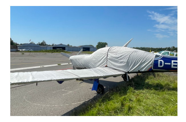
Diamond DA-50 Extended Canopy/Engine Cover, Wing Covers