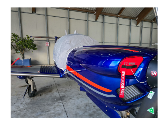
Diamond DA-50 Canopy Cover, Engine Plugs