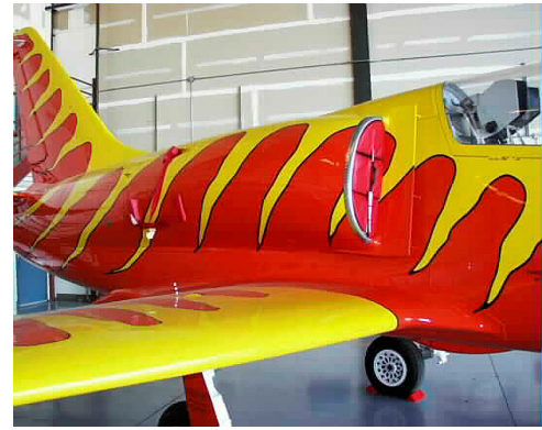
Inlet Plug, folding type