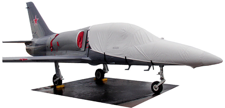
L-39 Canopy/Nose Cover & Plugs