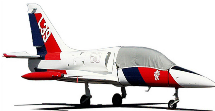
Canopy Cover for Aero L-39 Albatros