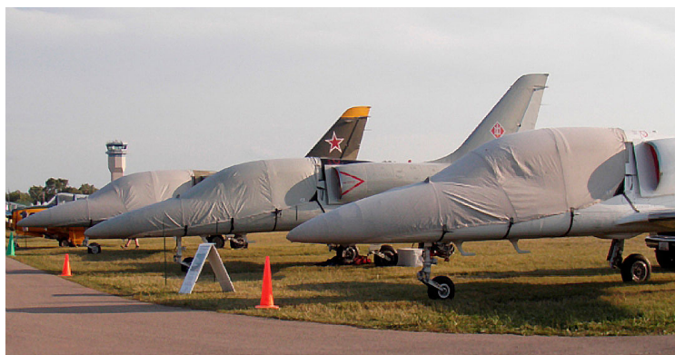
L-39 Canopy/Nose Covers & Plugs

This cover type is made from Silver Acrylic Sunbrella canvas and is 100% lined with a soft and smooth microfiber. Bruce's Custom Covers developed this material combination especially for aircraft protection. The outer material is medium weight and treated for water resistance, UV resistance and anti-static buildup. The inner lining is a very soft and smooth microfiber to prevent scratching. The material is very reflective, and tests show that the cabin interior temperature can be reduced to near-ambient temperature on the hottest of days. It is water, ice and snow repellent, yet breathable to allow moisture to escape from between the cover and the aircraft surface.