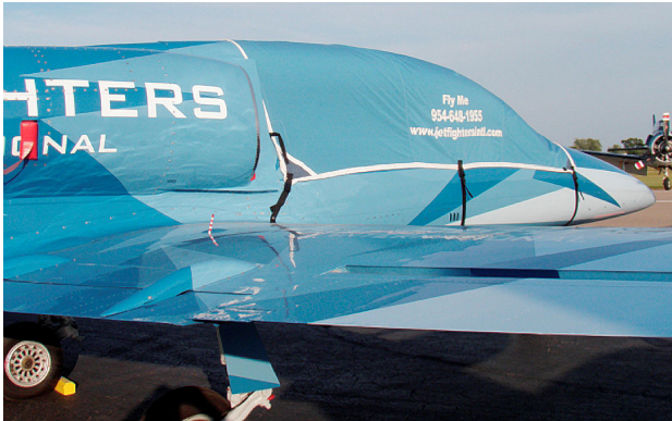
L-39 Canopy Cover & Plugs