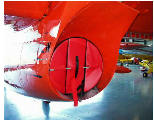
Exhaust Plug, folding type