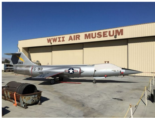
Lockheed F-104 Starfighter Canopy Cover, Single Seat Model