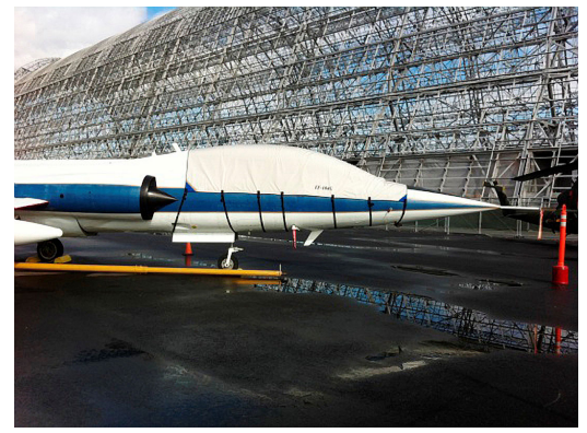
F-104 Tandem Canopy Cover