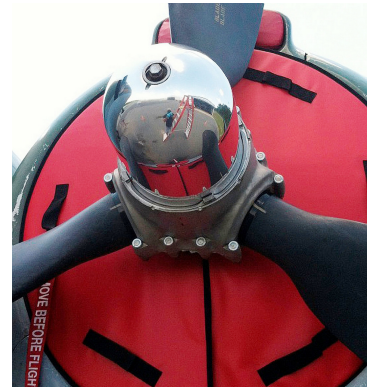
C-46 Radial Engine Intake Plug