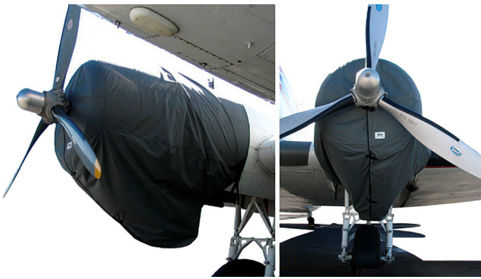
DC3 Engine Covers are custom made for various engine mod's.