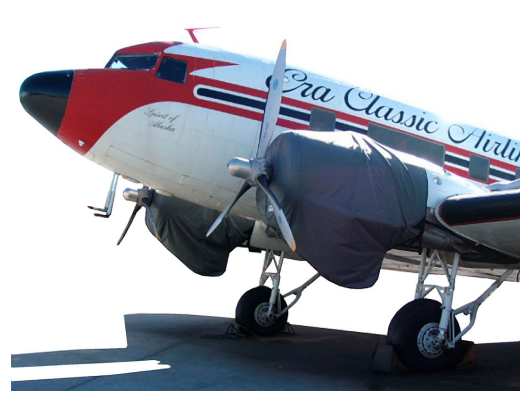
Engine Covers are available in either standard or insulated designs.