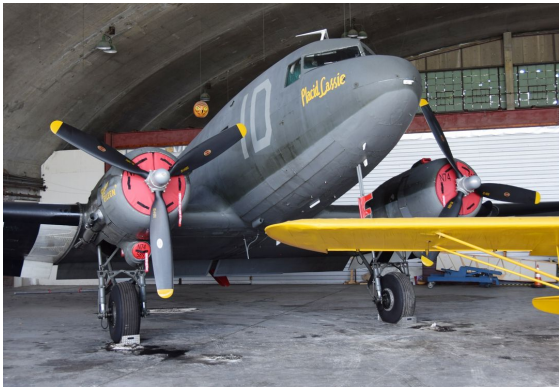
Douglas DC-3 Engine & Oil Cooler Plugs

Engine Inlet Plugs are custom fit for your Douglas DC-3 intakes, made with heavy-duty vinyl material, and stuffed with a single block of sculpted urethane foam. Each plug has a zipper that allows the foam to be removed and dried if necessary. Engine plugs have warning flags that are visible from the cockpit or 'remove before flight' streamers sewn onto the face of the plugs. Most plugs are imprinted with the aircraft registration number in black for an extra charge. Storage bag NOT included. Engine plugs may be inserted after flight when the engine is still warm. Engine Inlet Plugs are commonly referred to as Cowl Plugs, Intake Plugs, Cowl Blocks, Engine Blocks, and Engine Bungs.