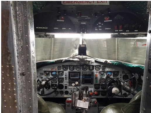
Douglas DC-3 Cockpit Heatshields

Cockpit Heatshields are interior sunshades for the aircraft's cockpit. The product is a unique composite of closed-cell foam with a silver mylar finish. The semi-rigid design is stiff enough to stand inside the window framing. The set folds up flat and is easily stored in the included storage sleeve. Some designs may require velcro and suction cups. A Heatshield is an excellent short-term remedy for cockpit overheating, but an external fabric cover is more effective for long-term protection.