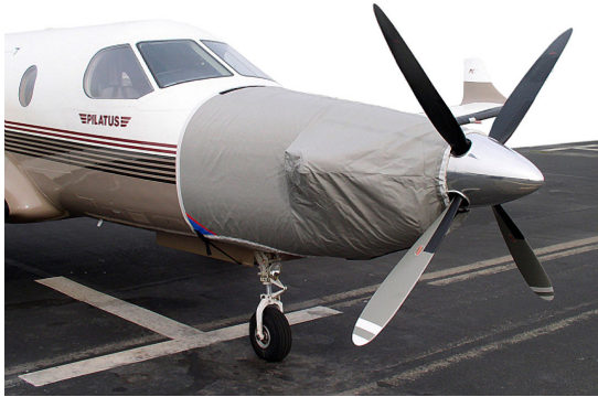
Pilatus PC-12 Engine Cover

This cover type is made from Silver Acrylic Sunbrella canvas and is 100% lined with a soft and smooth microfiber. Bruce's Custom Covers developed this material combination especially for aircraft protection. The outer material is medium weight and treated for water resistance, UV resistance and anti-static buildup. The inner lining is a very soft and smooth microfiber to prevent scratching. The material is very reflective, and tests show that the cabin interior temperature can be reduced to near-ambient temperature on the hottest of days. It is water, ice and snow repellent, yet breathable to allow moisture to escape from between the cover and the aircraft surface.