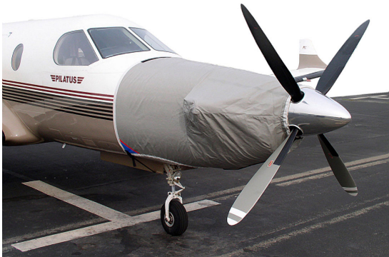
Pilatus PC-12 Engine Cover