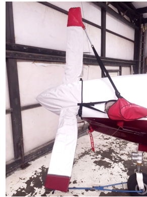
Pilatus PC-12 Prop Cover, Prop Tie/Exhaust Cover