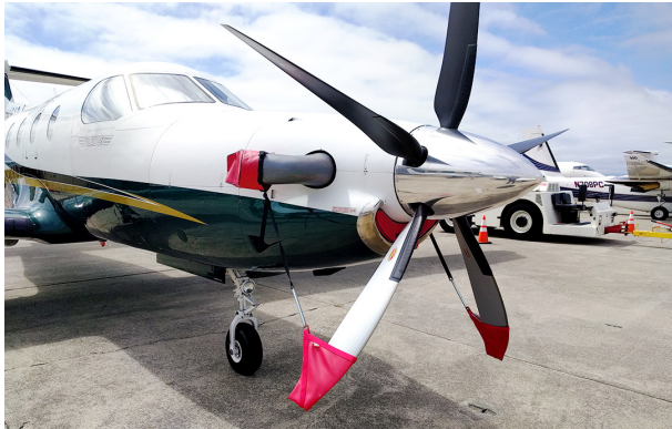
Main Intake Plug and Prop-Tie/Exhaust Covers. (Sold Separately)

Engine Inlet Plugs are custom fit for your Beech Denali 220 intakes, made with heavy-duty vinyl material, and stuffed with a single block of sculpted urethane foam. Each plug has a zipper that allows the foam to be removed and dried if necessary. Engine plugs have warning flags that are visible from the cockpit or 'remove before flight' streamers sewn onto the face of the plugs. Most plugs are imprinted with the aircraft registration number in black for an extra charge. Storage bag NOT included. Engine plugs may be inserted after flight when the engine is still warm. Engine Inlet Plugs are commonly referred to as Cowl Plugs, Intake Plugs, Cowl Blocks, Engine Blocks, and Engine Bungs.