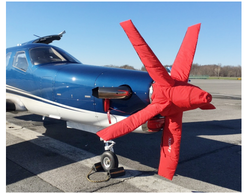
Pilatus PC-12 Exhaust Cover, Fully Enclosed, for protection against corrosion. Socata TBM Insulated 5-Blade Prop/Spinner Cover