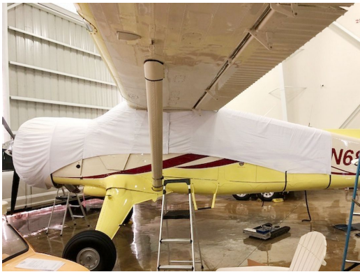
De Havilland Beaver Canopy/Engine Cover, test fit cover