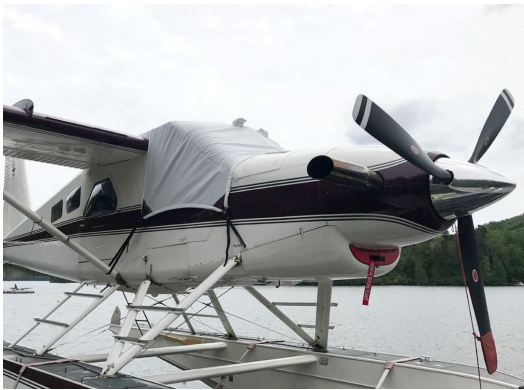
DeHavilland Turbo Beaver Cockpit Cover and Inlet Plug

This cover type is made from Silver Acrylic Sunbrella canvas and is 100% lined with a soft and smooth microfiber. Bruce's Custom Covers developed this material combination especially for aircraft protection. The outer material is medium weight and treated for water resistance, UV resistance and anti-static buildup. The inner lining is a very soft and smooth microfiber to prevent scratching. The material is very reflective, and tests show that the cabin interior temperature can be reduced to near-ambient temperature on the hottest of days. It is water, ice and snow repellent, yet breathable to allow moisture to escape from between the cover and the aircraft surface.