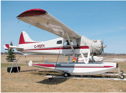
Beaver Windshield/Engine Cover

Travel Covers are made with Silver Solution-Dyed Polyester fabric and only lined over the windshield to save weight. The material is lightweight and more compact for easy stowage in the aircraft. The polyester material is water resistant, but only intended for occasional use outside. We also have an ultra lightweight material available for fitted hangar dust covers. For daily outdoor use, the non-travel Sunbrella Cover is the best choice.