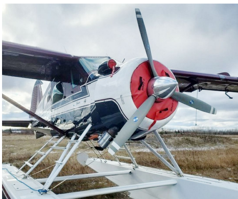
DeHavilland DH2 Beaver Engine Plugs

Engine Inlet Plugs are custom fit for your DeHavilland Beaver DHC-2, U-6A, U-6B intakes, made with heavy-duty vinyl material, and stuffed with a single block of sculpted urethane foam. Each plug has a zipper that allows the foam to be removed and dried if necessary. Engine plugs have warning flags that are visible from the cockpit or 'remove before flight' streamers sewn onto the face of the plugs. Most plugs are imprinted with the aircraft registration number in black for an extra charge. Storage bag NOT included. Engine plugs may be inserted after flight when the engine is still warm. Engine Inlet Plugs are commonly referred to as Cowl Plugs, Intake Plugs, Cowl Blocks, Engine Blocks, and Engine Bungs.