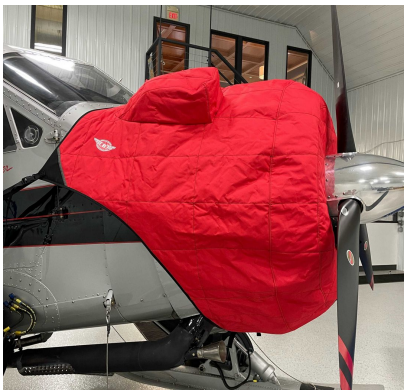
DeHavilland Beaver Insulated Engine Cover

This cover type is made from Silver Acrylic Sunbrella canvas and is 100% lined with a soft and smooth microfiber. Bruce's Custom Covers developed this material combination especially for aircraft protection. The outer material is medium weight and treated for water resistance, UV resistance and anti-static buildup. The inner lining is a very soft and smooth microfiber to prevent scratching. The material is very reflective, and tests show that the cabin interior temperature can be reduced to near-ambient temperature on the hottest of days. It is water, ice and snow repellent, yet breathable to allow moisture to escape from between the cover and the aircraft surface.