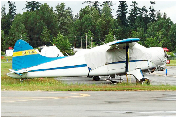
Beaver Canopy/Engine Cover