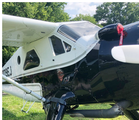
DeHavilland DH-2 Upper Cowling Air Scoop Plug