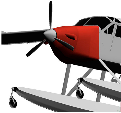
Turbo Beaver Insulated Engine Cover, 3D model

The material is very reflective, and tests show that the cabin interior temperature can be reduced to near-ambient temperature on the hottest of days. It is water, ice and snow repellent, yet breathable to allow moisture to escape from between the cover and the aircraft surface.