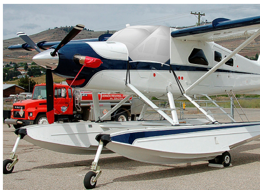
Turbo Beaver Cockpit Cover, Prop Tie/Exhaust Covers, Engine Plug