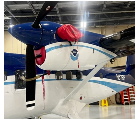
DeHavilland Twin Otter DHC6 Intake Plug, Exhaust Covers