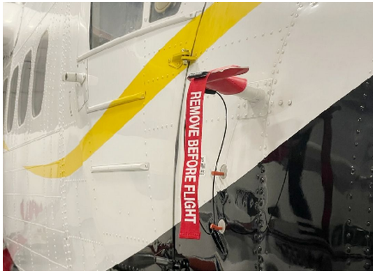
DeHavilland DH-6 Pitot Cover with Static Port Plugs