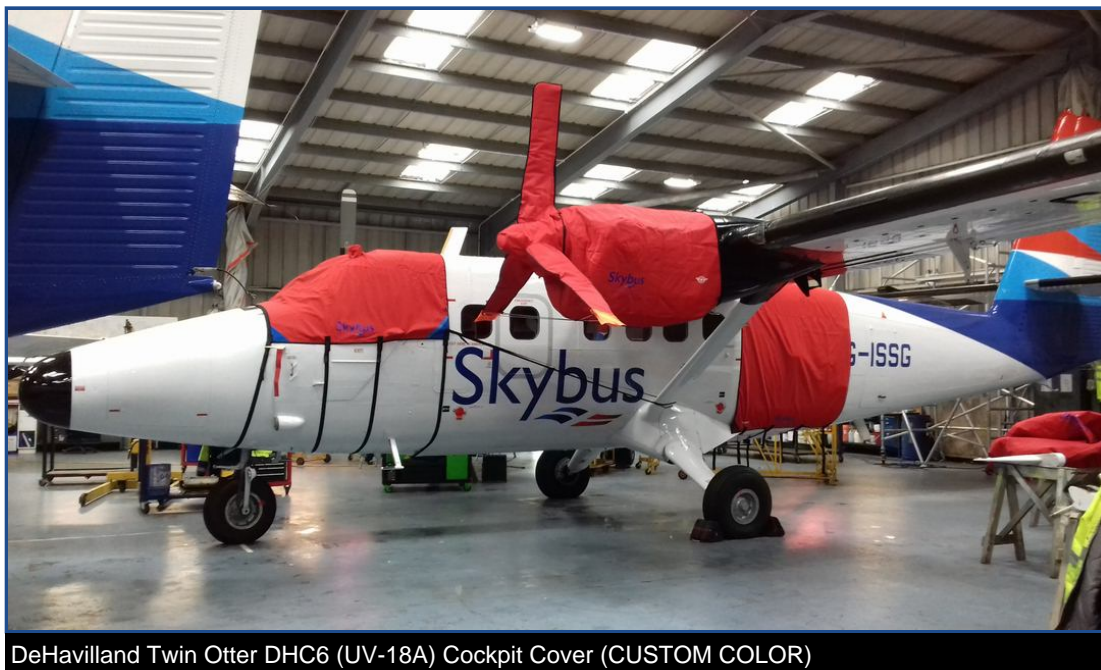
DeHavilland Twin Otter DHC6 (UV-18A) Cockpit Cover (CUSTOM COLOR)