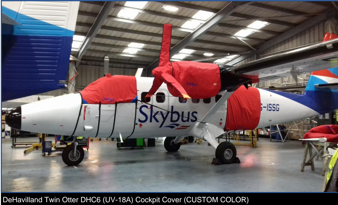
DeHavilland Twin Otter DHC6 (UV-18A) Cockpit Cover (CUSTOM COLOR)