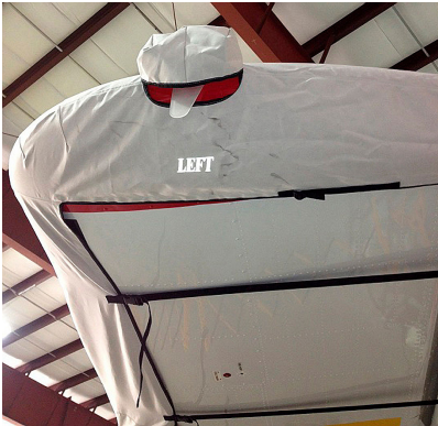
De Havilland Twin Otter Wing Cover wing tip detail

WINTER USE MATERIAL - Made with Solution-Dyed Polyester fabric, this option is intended for seasonal use to aid in deicing, rain mitigation, or for occasional travel. The material is lighter and more compact, but more susceptible to UV damage and may have a shorter useful life if used continuously outside than the all-year use material.