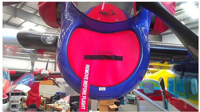
De Havilland Twin Otter Engine Inlet Plug and Exhaust Covers