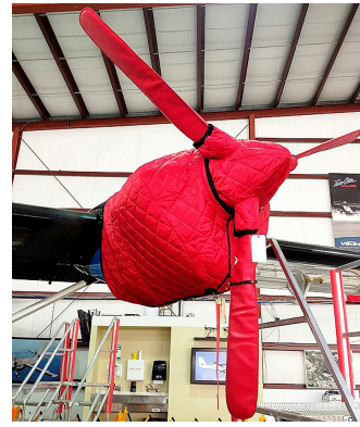
DeHavilland DH-6 Intake Plugs, Exhaust Covers De Havilland Twin Otter Insulated Engine & Insulated Propellor/Spinner Covers