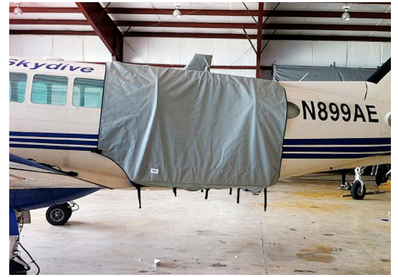
750XL Jump Door Cover