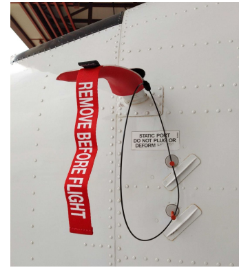
De Havilland DH-6 Twin Otter Pitot Cover, Static Air Plugs