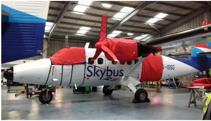
DeHavilland Twin Otter DHC6 (UV-18A) Cockpit Cover (CUSTOM COLOR)