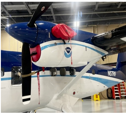
DeHavilland Twin Otter DHC6 Intake Plug, Exhaust Covers