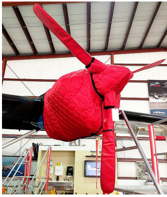
De Havilland Twin Otter Insulated Engine & Insulated Propellor/Spinner Covers