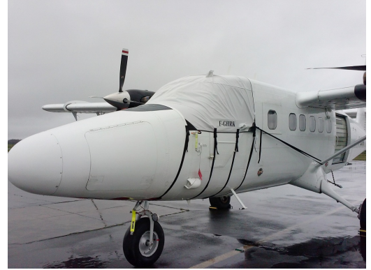
Twin Otter Cockpit Cover