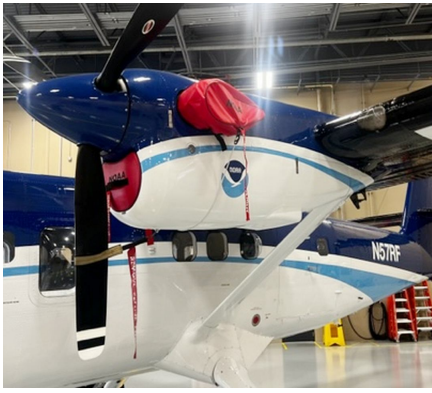
DeHavilland Twin Otter DHC6 Intake Plug, Exhaust Covers