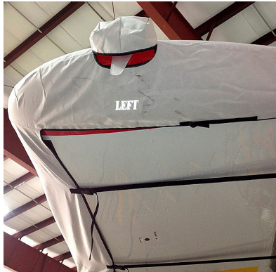
De Havilland Twin Otter Wing Cover wing tip detail

WINTER USE MATERIAL - Made with Solution-Dyed Polyester fabric, this option is intended for seasonal use to aid in deicing, rain mitigation, or for occasional travel. The material is lighter and more compact, but more susceptible to UV damage and may have a shorter useful life if used continuously outside than the all-year use material.