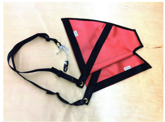
Aerospatiale ATR-42/72 Prop Tie-Downs