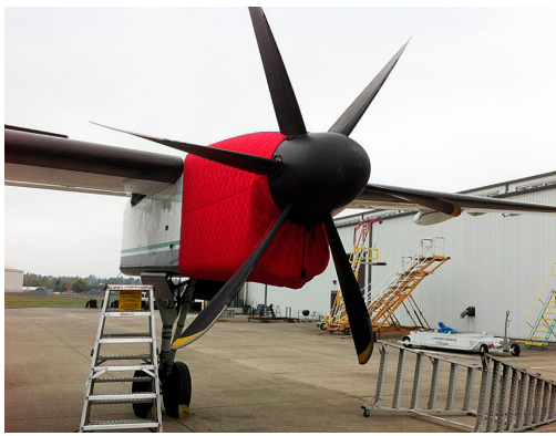
Dash 8-Q400 Insulated Engine Cover