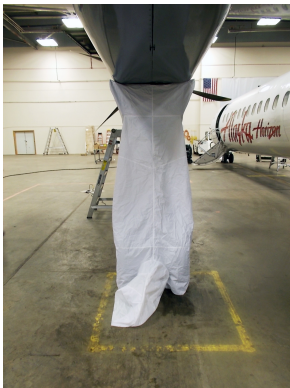
Q400, Main gear landing/tire covers - Cold Weather Ops

ALL-YEAR USE MATERIAL - Made with Silver Acrylic Sunbrella canvas, the all-year use material is the best option for sun protection and cover longevity. This heavier more durable material is intended for all weather conditions, such as rain and snow or lots of sun.