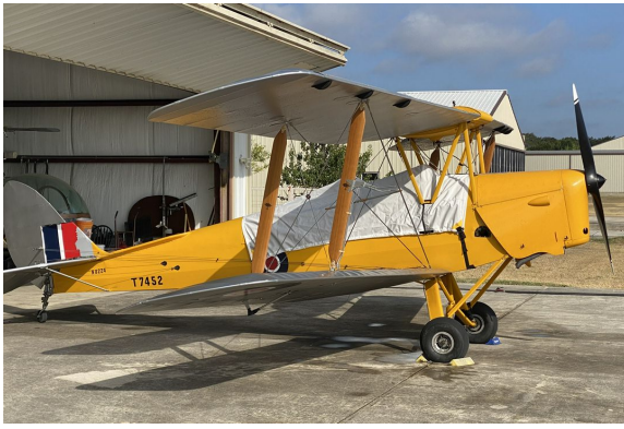
Dehavilland DH-82 Tiger Moth Canopy Cover