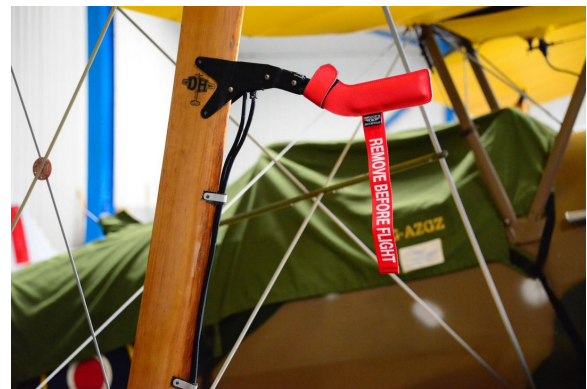
DeHavilland DH-82 Tiger Moth Pitot Cover