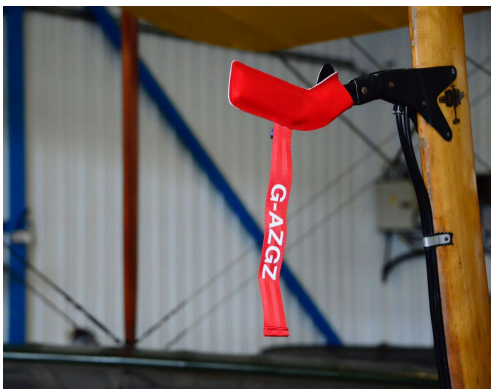
DeHavilland DH-82 Tiger Moth Pitot Cover

DeHavilland DH-82 Tiger Moth Pitot Tube Covers , NOT HEAT RESISTANT TYPE, are made of Naugahyde vinyl, and are designed to cover the entire pitot assembly. Slipping over the tube, the cover tightens around the base with a Velcro strap detail. A "Remove Before Flight" streamer is attached to the cover. Heat Resistant Pitot Covers are an upgrade to this design, and help prevent the pitot cover from melting onto the tube if the pitot heat is accidentally turned on while installed. If you want the set tethered together, please let us know.