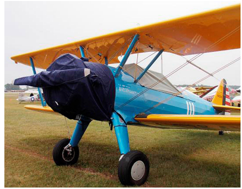
Stearman PT-13 Engine Cover