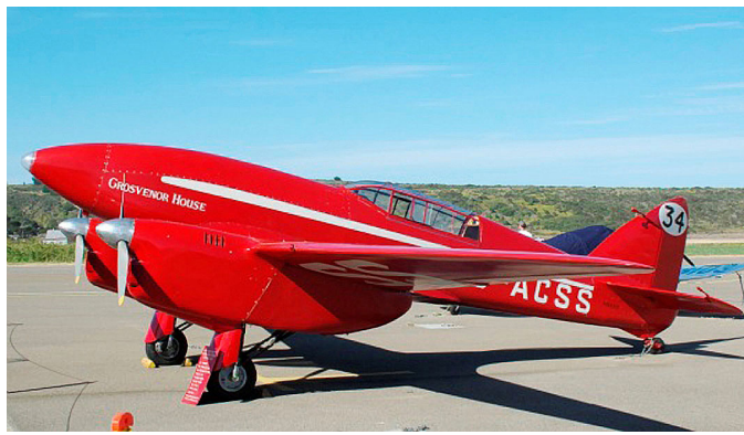
Cockpit Cover for the De Havilland Comet Racer