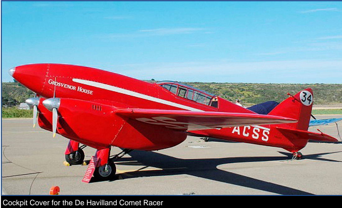
Cockpit Cover for the De Havilland Comet Racer