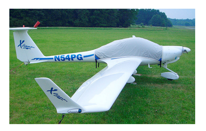
Dimona Xtreme Canopy Cover