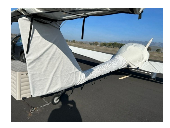
Dimona HK-36 Empennage Cover Set

WINTER USE MATERIAL - Made with Solution-Dyed Polyester fabric, this option is intended for seasonal use to aid in deicing, rain mitigation, or for occasional travel. The material is lighter and more compact, but more susceptible to UV damage and may have a shorter useful life if used continuously outside than the all-year use material.