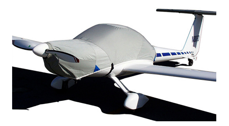
Diamond DA-20 Canopy/Engine Cover