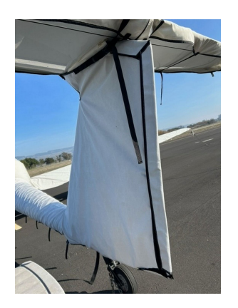
Dimona HK-36 Empennage Cover Set