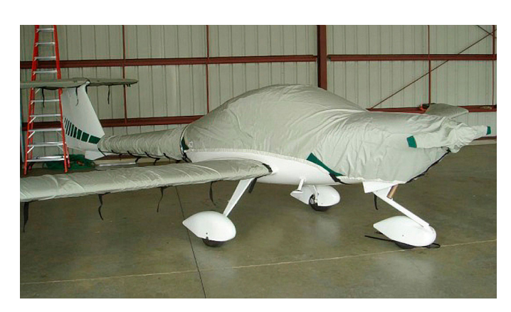
DA-20 Canopy/Engine, Prop/Spinner, Wing, Tailboom, Horiz. Stab. Covers