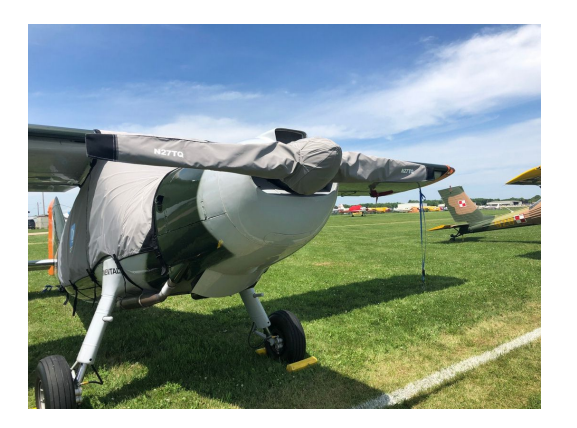
Dornier DO-27 Canopy Cover, Prop Cover