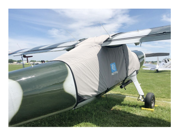
Dornier DO-27 Canopy Cover