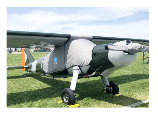
Dornier DO-27 Canopy Cover, Prop Cover