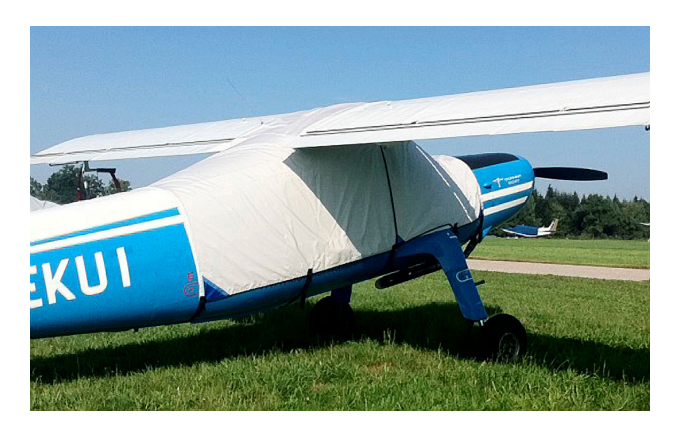
Dornier Do27 Canopy Cover, over-top type