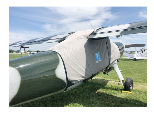
Dornier DO-27 Canopy Cover

This cover type is made from Silver Acrylic Sunbrella canvas and is 100% lined with a soft and smooth microfiber. Bruce's Custom Covers developed this material combination especially for aircraft protection. The outer material is medium weight and treated for water resistance, UV resistance and anti-static buildup. The inner lining is a very soft and smooth microfiber to prevent scratching. The material is very reflective, and tests show that the cabin interior temperature can be reduced to near-ambient temperature on the hottest of days. It is water, ice and snow repellent, yet breathable to allow moisture to escape from between the cover and the aircraft surface.