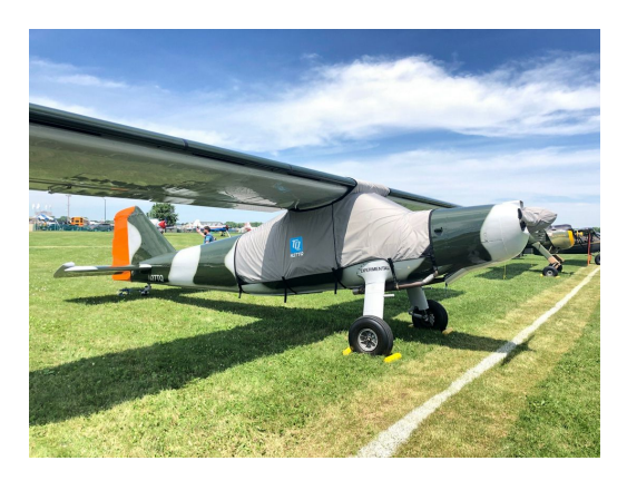
Dornier DO-27 Canopy Cover, Prop Cover