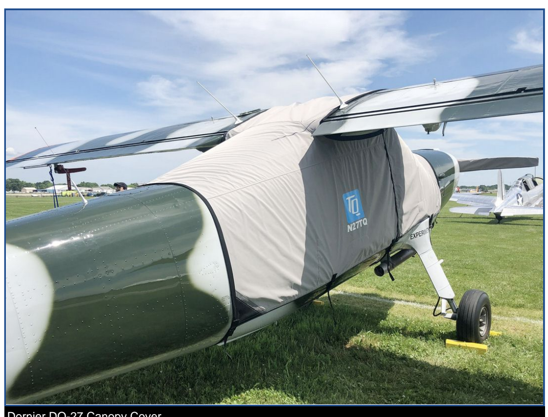
Dornier DO-27 Canopy Cover