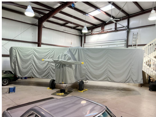
Stearman PT-13 Full Body Dust Cover

Some high value aircraft end up logging lots of hangar time, and become dust magnets in the process. A high quality, well fitting dust cover provides easy assurance that the aircraft's surfaces remain clean and free of grit and grime. Available in a large variety of colors, each dust cover is custom made according to aircraft details and customer preferences. Fire retardant fabrics are also available.