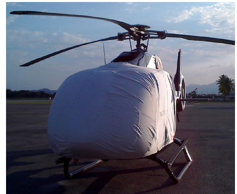
Bubble Cover and Intake/Exhaust Cover