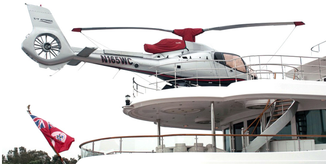
Intake/Exhaust Cover, Rotor Hub Cover (w/ skirt) & Blade Tie Downs

circulation and drainage in freezing weather. Some part numbers have features for an extra charge.