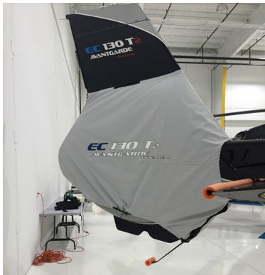
EC-130 Tailfan Cover

The Tailboom Cover details vary by model, but generally the helicopter tail boom cover encloses the tail boom from the "bottleneck" to the aft end. They usually also cover the horizontal stabilizers, and are custom made to allow for antennae, lights, and other protrusions. They attach with straps underneath the tail boom. Covers for the vertical and horizontal stabilizers are also available separately. Specific information for each model is available on request.