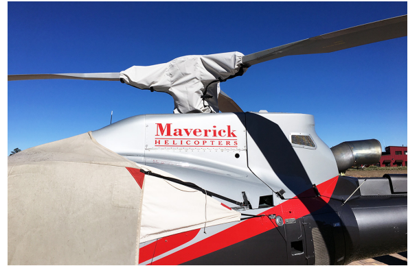
Eurocopter EC-130 Main Rotor Hub Cover