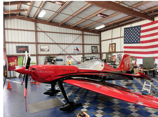
Gamebird GB-1 Solar Cap (single place), CUSTOM COVERS & IMPRINTING AVAILABLE!