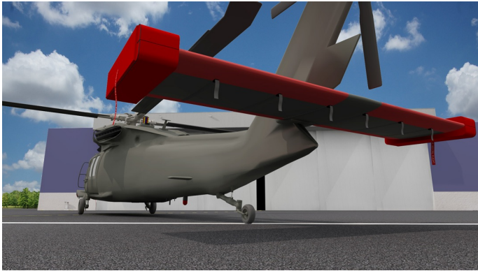
Padded Horizontal Stab Covers, Wingtip Pads (illustration)

Designed to prevent damage to the aircraft extremities in crowded hangars, these products are made of bright red Naugahyde and thickly padded with a sandwich of closed cell foam.