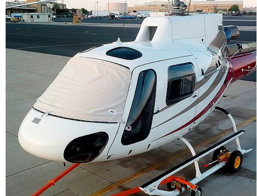
AS350 Windshield Cover, pinches in door jambs