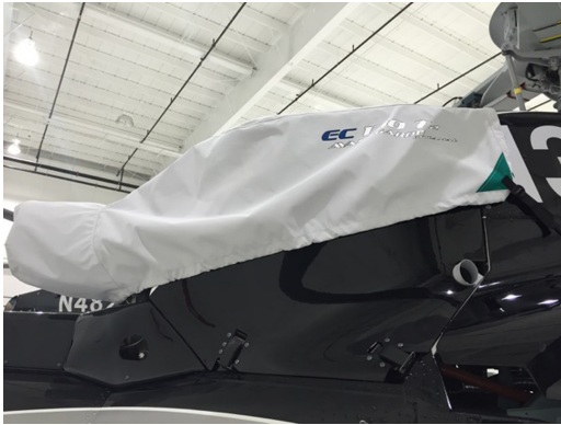
EC-130 Engine Area/Exhaust Cover

tight at the blade root with straps and quick-release plastic buckles. The Cold Weather Blade Covers are fitted with full-length zippers and optional deice “boots” designed to accept a preheater hose; a small opening at the tip of the cover allows for some air circulation and drainage in freezing weather. Some part numbers have features for an extra charge.