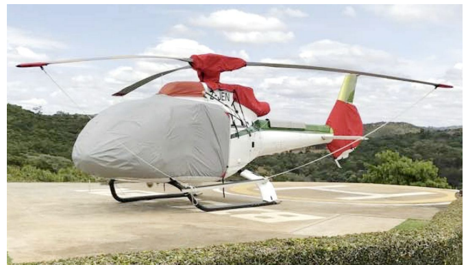
EC130 Bubble, Intake, Exhaust, Rotor Hub & Tailfan Covers