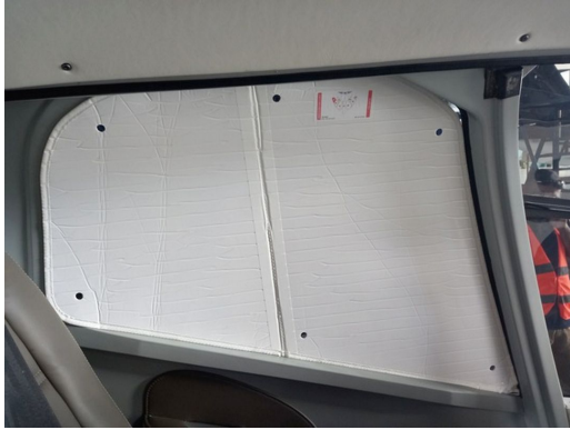
Airbus Helicopter EC130 B4 Side Window Heatshields

Heatshields are interior sunshades for an aircraft's windows or canopy glass. The product is a unique composite of closed-cell foam with a silver mylar finish. The semi-rigid design is stiff enough to stand along the inside of the windshield using sun visors or window framing. It folds up flat and easily stores in the included storage sleeve. Some designs may require velcro and suction cups. A Heatshield is an excellent short-term remedy for cockpit overheating.