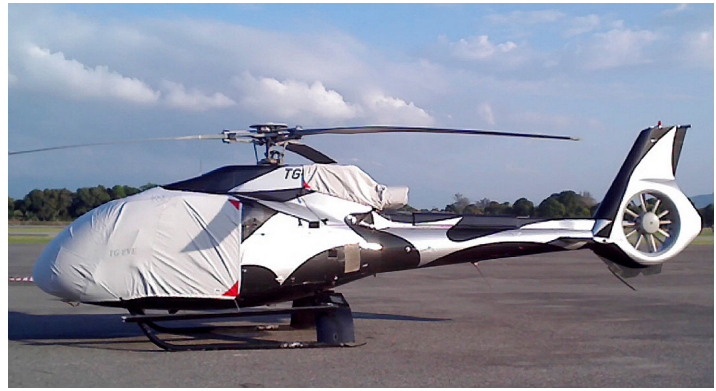
Bubble Cover and Intake/Exhaust Cover