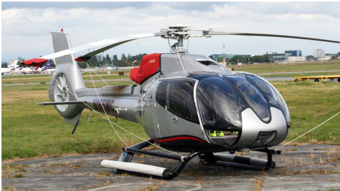
Intake/Exhaust Cover, Rotor Hub Cover (w/ skirt) & Blade Tie Downs