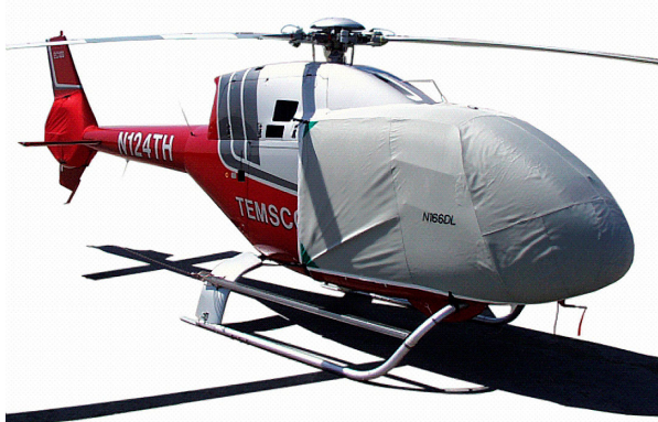
Eurocopter EC-120 Bubble Cover & Tailfan Cover

This cover type is made from Silver Acrylic Sunbrella canvas and is 100% lined with a soft and smooth microfiber. Bruce's Custom Covers developed this material combination especially for aircraft protection. The outer material is medium weight and treated for water resistance, UV resistance and anti-static buildup. The inner lining is a very soft and smooth microfiber to prevent scratching. The material is very reflective, and tests show that the cabin interior temperature can be reduced to near-ambient temperature on the hottest of days. It is water, ice and snow repellent, yet breathable to allow moisture to escape from between the cover and the aircraft surface.