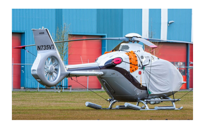
Airbus EC135T3 Blade Tie-Downs