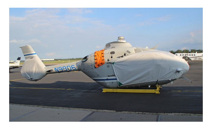
Eurocopter EC-135 Bubble & Tailfan Covers