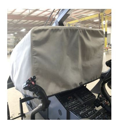
Eurocopter EC-135 Instrument Panel Heatshield Cover