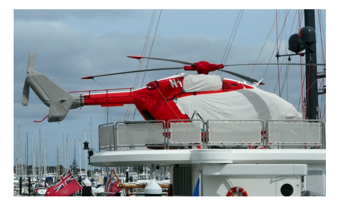
Eurocopter EC-135 Bubble, Engine, Rotor Hub, Tail Surfaces Covers