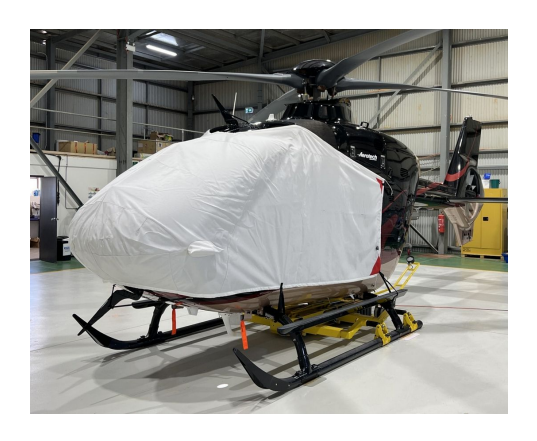
Airbus EC-135 Bubble Cover (with Wire Strike)