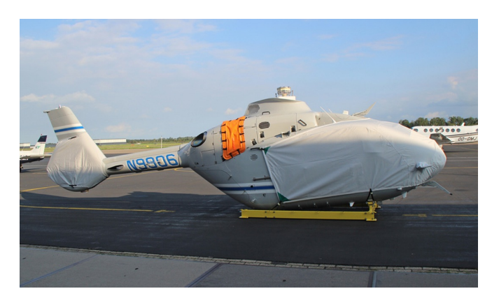
Eurocopter EC-135 Bubble & Tailfan Covers