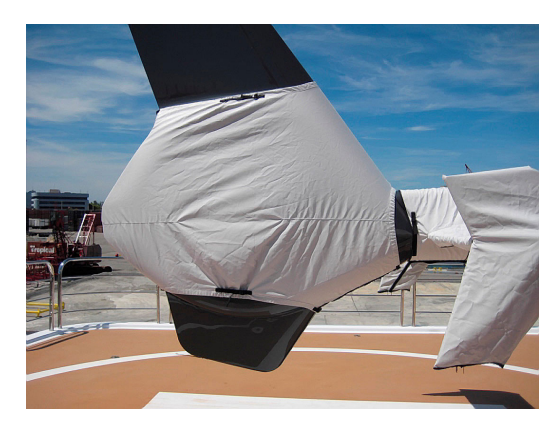
EC-135 Tailfan Cover and Tailboom Stabilizer Cover