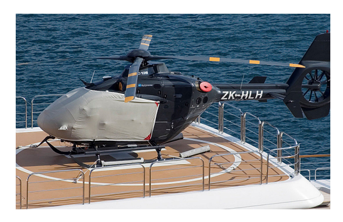
EC-135 Bubble Cover & Exhaust Plugs

This cover type is made from Silver Acrylic Sunbrella canvas and is 100% lined with a soft and smooth microfiber. Bruce's Custom Covers developed this material combination especially for aircraft protection. The outer material is medium weight and treated for water resistance, UV resistance and anti-static buildup. The inner lining is a very soft and smooth microfiber to prevent scratching. The material is very reflective, and tests show that the cabin interior temperature can be reduced to near-ambient temperature on the hottest of days. It is water, ice and snow repellent, yet breathable to allow moisture to escape from between the cover and the aircraft surface.