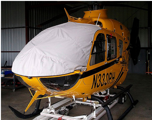
EC-135 Windshield/Skylights Cover, pinches in door jambs