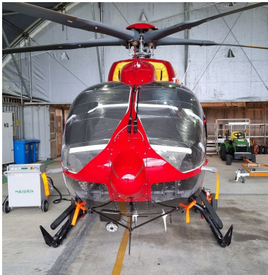
Airbus Helicopter H145D3 Windshield Heatshields, Engine Plugs