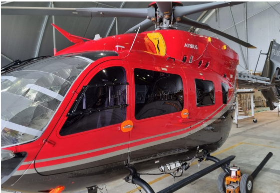
Airbus Helicopter H145D3 Intake Plugs

The Engine Inlet Plugs are custom fit for your Eurocopter EC-145, UH-145, BK-117 D-2 intakes, made with heavy-duty vinyl material, and stuffed with a single block of sculpted urethane foam. Each plug has a zipper that allows the foam to be removed and dried if necessary. Engine plugs have 'Remove Before Flight' streamers sewn onto the face of the plugs. Most plugs are imprinted with the aircraft registration number in black for an extra charge. Storage bag NOT included. Engine plugs may be inserted after flight when the engine is still warm. Engine Inlet Plugs are commonly referred to as Cowl Plugs, Intake Plugs, Cowl Blocks, Engine Blocks, and Engine Bungs.