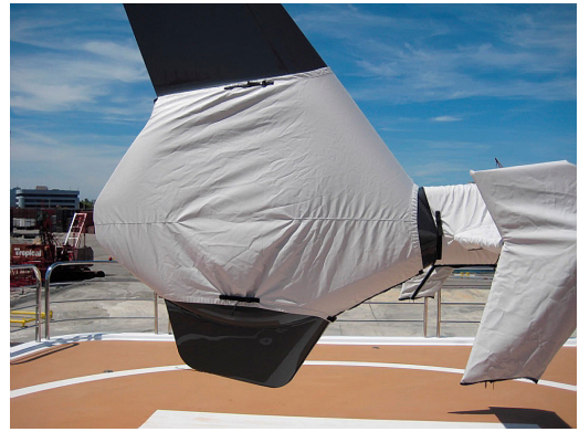
EC-135 Tailfan Cover and Tailboom Stabilizer Cover