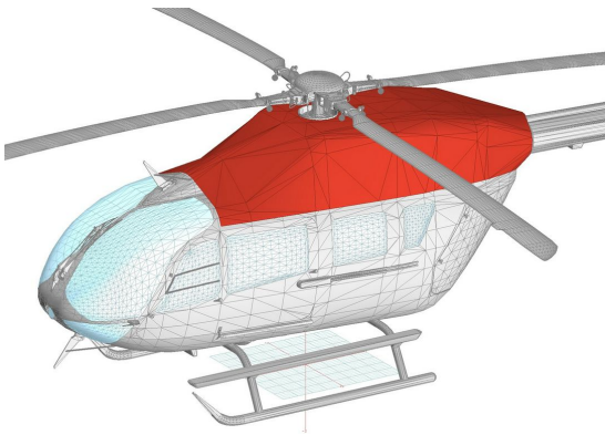
Intake/Exhaust Engine Area Cover, 3D Rendering