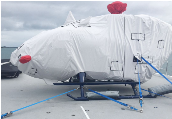
Eurocopter EC-145 D2 Main Body Cover

This cover type is made from Silver Acrylic Sunbrella canvas and is 100% lined with a soft and smooth microfiber. Bruce's Custom Covers developed this material combination especially for aircraft protection. The outer material is medium weight and treated for water resistance, UV resistance and anti-static buildup. The inner lining is a very soft and smooth microfiber to prevent scratching. The material is very reflective, and tests show that the cabin interior temperature can be reduced to near-ambient temperature on the hottest of days. It is water, ice and snow repellent, yet breathable to allow moisture to escape from between the cover and the aircraft surface.