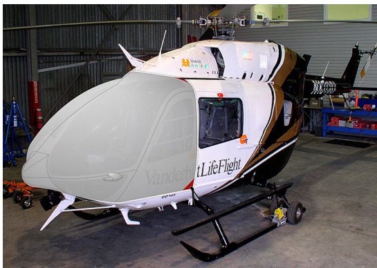
EC-145 Windshield/Nose Cover (illustration)