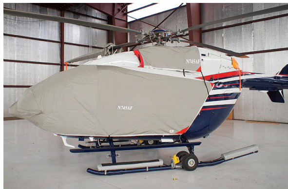
Bubble Cover w/ nose mounted radome, Upper Deck Plugs/Cover