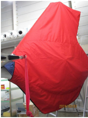
Airbus EC145 Tailfan Housing Fenestron Cover