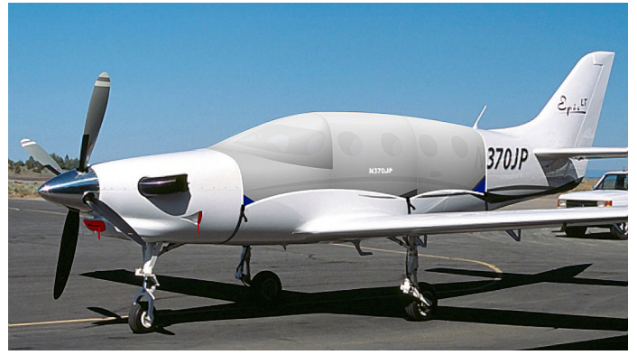
Epic LT Canopy Cover & Engine Plugs