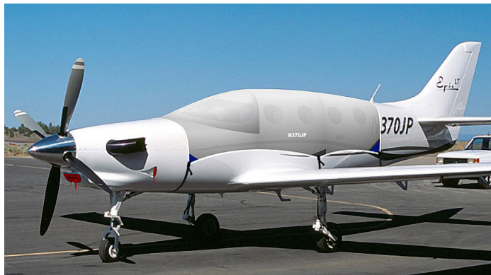
Epic LT Canopy Cover & Engine Plugs

Engine Inlet Plugs are custom fit for your Epic E1000 intakes, made with heavy-duty vinyl material, and stuffed with a single block of sculpted urethane foam. Each plug has a zipper that allows the foam to be removed and dried if necessary. Engine plugs have warning flags that are visible from the cockpit or 'remove before flight' streamers sewn onto the face of the plugs. Most plugs are imprinted with the aircraft registration number in black for an extra charge. Storage bag NOT included. Engine plugs may be inserted after flight when the engine is still warm. Engine Inlet Plugs are commonly referred to as Cowl Plugs, Intake Plugs, Cowl Blocks, Engine Blocks, and Engine Bungs.