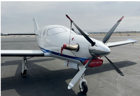
Epic E1000 Prop Tie/Exhaust Covers, Intake Cover, Windshield HeatShields