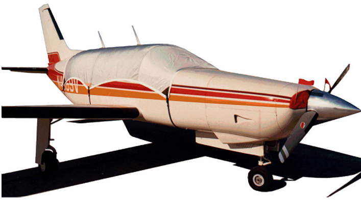
Malibu/Mirage/Meridian Standard Canopy Cover