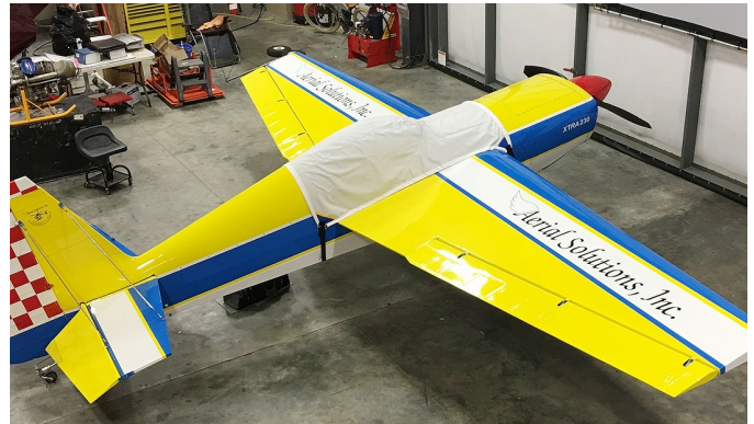
Extra 230 Canopy Cover