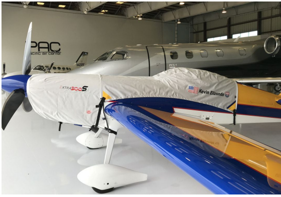
Extra 300S Canopy & Engine Covers