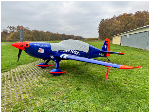
EXTRA 330LT Travel Cover, Light Weight Canopy Cover (2 seat model, Low Wing Models)

Travel Covers are made with Silver Solution-Dyed Polyester fabric and only lined over the windshield to save weight. The material is lightweight and more compact for easy stowage in the aircraft. The polyester material is water resistant, but only intended for occasional use outside. We also have an ultra lightweight material available for fitted hangar dust covers. For daily outdoor use, the non-travel Sunbrella Cover is the best choice.