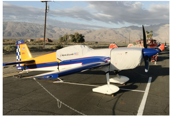
Extra 300S Canopy & Engine Covers