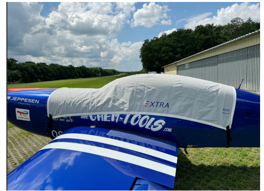
Extra 300 Canopy Cover