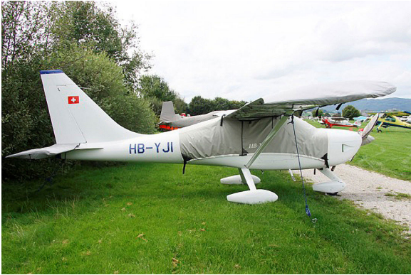
Glaser Canopy, Wings, Horizontal Stab. & Prop Covers

WINTER USE MATERIAL - Made with Solution-Dyed Polyester fabric, this option is intended for seasonal use to aid in deicing, rain mitigation, or for occasional travel. The material is lighter and more compact, but more susceptible to UV damage and may have a shorter useful life if used continuously outside than the all-year use material.