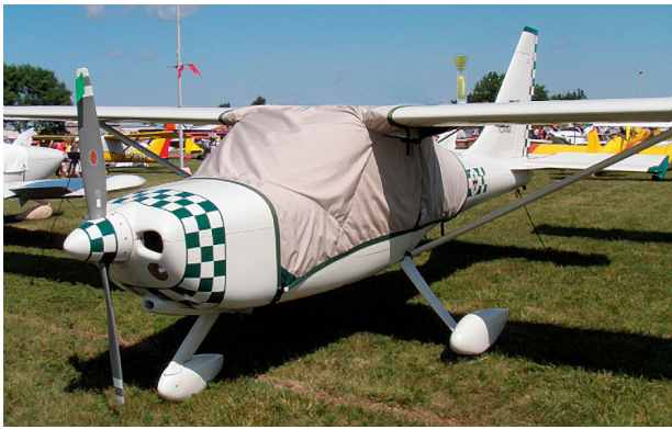
Glastar Over-Top Canopy Cover