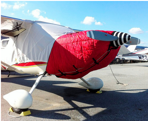
Glastar Insulated Engine Cover

This cover type is made from Silver Acrylic Sunbrella canvas and is 100% lined with a soft and smooth microfiber. Bruce's Custom Covers developed this material combination especially for aircraft protection. The outer material is medium weight and treated for water resistance, UV resistance and anti-static buildup. The inner lining is a very soft and smooth microfiber to prevent scratching. The material is very reflective, and tests show that the cabin interior temperature can be reduced to near-ambient temperature on the hottest of days. It is water, ice and snow repellent, yet breathable to allow moisture to escape from between the cover and the aircraft surface.