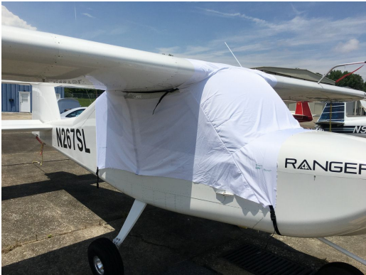
Vashon Ranger VR-7 Canopy Cover, test fit cover