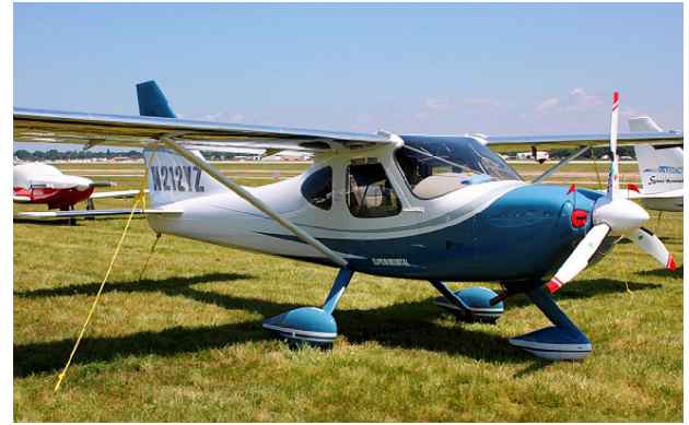
Glastar Sportsman Engine Inlet Plugs