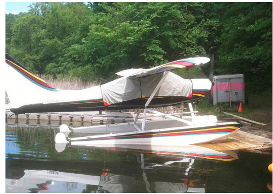
Glastar Sportsman Canopy Cover