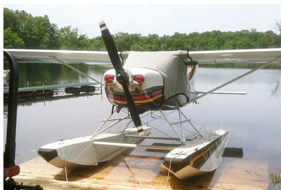
Glastar Sportsman Canopy Cover and Engine Plugs