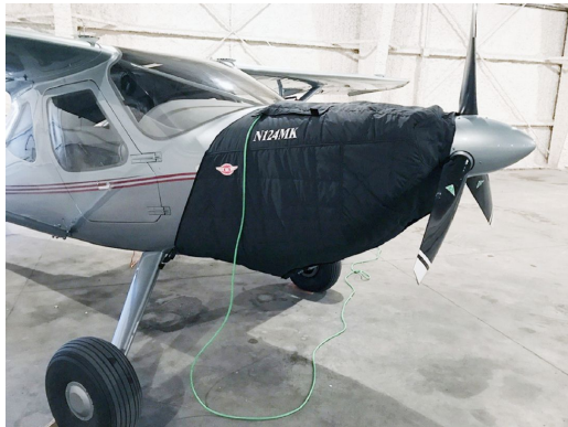
Glasair Aviation Glastar, Sportsman 2+2 Insulated Engine Cover

This cover type is made from Silver Acrylic Sunbrella canvas and is 100% lined with a soft and smooth microfiber. Bruce's Custom Covers developed this material combination especially for aircraft protection. The outer material is medium weight and treated for water resistance, UV resistance and anti-static buildup. The inner lining is a very soft and smooth microfiber to prevent scratching. The material is very reflective, and tests show that the cabin interior temperature can be reduced to near-ambient temperature on the hottest of days. It is water, ice and snow repellent, yet breathable to allow moisture to escape from between the cover and the aircraft surface.