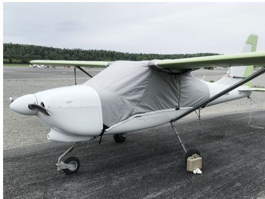
Glasair Aviation Glasair, Sportsman 2+2 Travel Cover, Light Weight Travel Canopy Cover