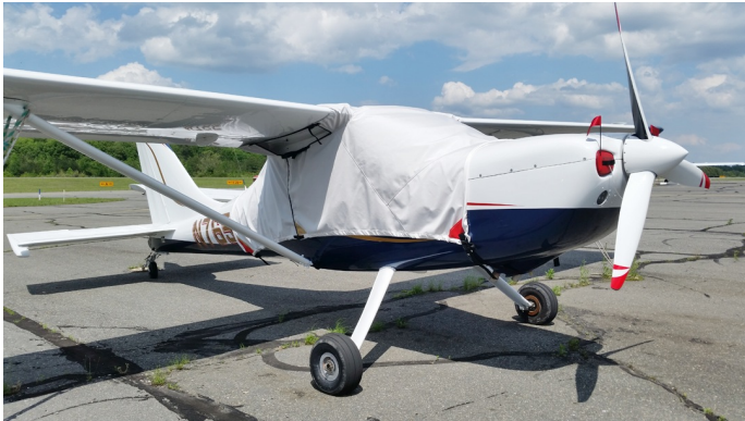
Glasair Over-Top Canopy Cover, Engine Plugs