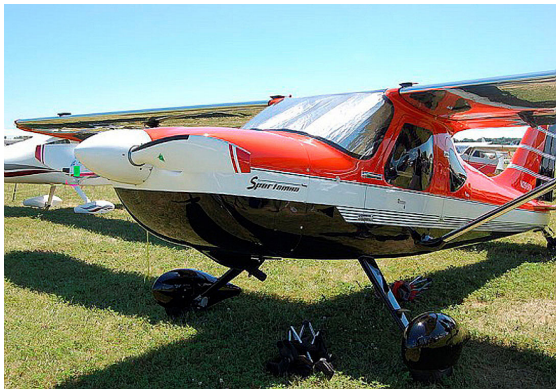
Glastar Sportsman Windshield HeatShield

or split right and left sides. A Heatshield is an excellent short-term remedy for cockpit overheating. An external fabric cover is far more effective and practical for long-term protection.