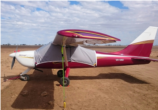
Glastar Sportsman Light Weight Travel Cover

Travel Covers are made with Silver Solution-Dyed Polyester fabric and only lined over the windshield to save weight. The material is lightweight and more compact for easy stowage in the aircraft. The polyester material is water resistant, but only intended for occasional use outside. We also have an ultra lightweight material available for fitted hangar dust covers. For daily outdoor use, the non-travel Sunbrella Cover is the best choice.