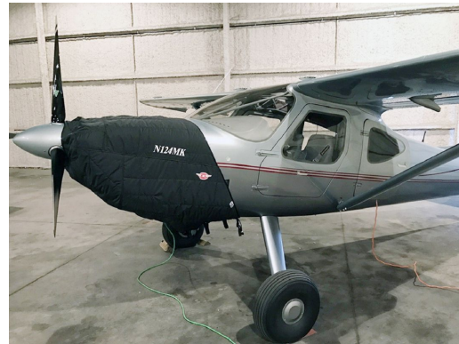
Glasair Aviation Glastar, Sportsman 2+2 Insulated Engine Cover