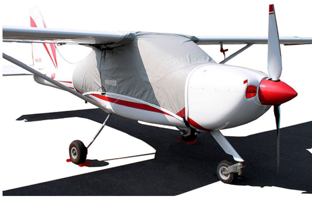
Glastar Over-Top Canopy Cover

This cover type is made from Silver Acrylic Sunbrella canvas and is 100% lined with a soft and smooth microfiber. Bruce's Custom Covers developed this material combination especially for aircraft protection. The outer material is medium weight and treated for water resistance, UV resistance and anti-static buildup. The inner lining is a very soft and smooth microfiber to prevent scratching. The material is very reflective, and tests show that the cabin interior temperature can be reduced to near-ambient temperature on the hottest of days. It is water, ice and snow repellent, yet breathable to allow moisture to escape from between the cover and the aircraft surface.