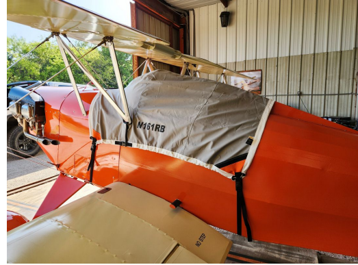
Burt Special Canopy Cover