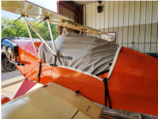
Burt Special Canopy Cover

This cover type is made from Silver Acrylic Sunbrella canvas and is 100% lined with a soft and smooth microfiber. Bruce's Custom Covers developed this material combination especially for aircraft protection. The outer material is medium weight and treated for water resistance, UV resistance and anti-static buildup. The inner lining is a very soft and smooth microfiber to prevent scratching. The material is very reflective, and tests show that the cabin interior temperature can be reduced to near-ambient temperature on the hottest of days. It is water, ice and snow repellent, yet breathable to allow moisture to escape from between the cover and the aircraft surface.