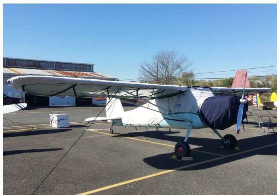
Cessna 140 Canopy, Engine, Wing & Empennage Covers