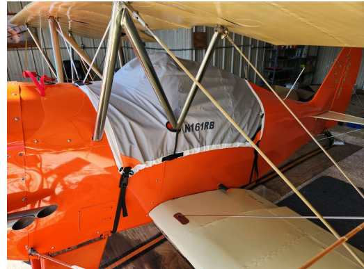
Burt Special Canopy Cover