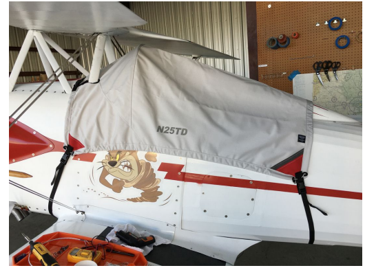
Lil Toot Canopy Cover