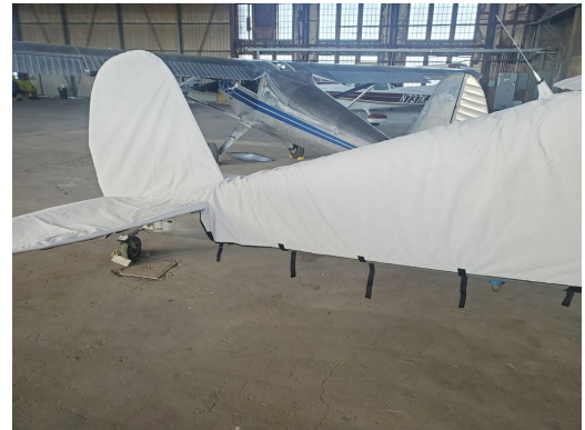
Cessna 140 Empennage Cover