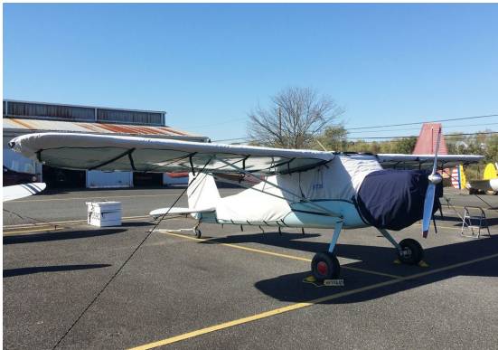
Cessna 140 Canopy, Engine, Wing & Empennage Covers

WINTER USE MATERIAL - Made with Solution-Dyed Polyester fabric, this option is intended for seasonal use to aid in deicing, rain mitigation, or for occasional travel. The material is lighter and more compact, but more susceptible to UV damage and may have a shorter useful life if used continuously outside than the all-year use material.