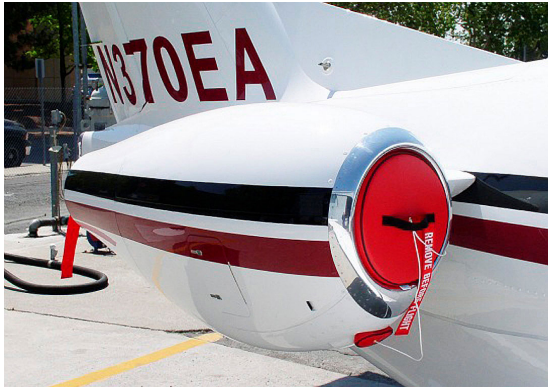
Eclipse Engine Inlet Plugs set

necessary. Engine plugs have 'remove before flight' streamers sewn onto the face of the plugs. Most plugs are imprinted with the aircraft registration number in black for an extra charge. Storage bag NOT included. Engine plugs may be inserted after flight when the engine is still warm. Engine Inlet Plugs are commonly referred to as Cowl Plugs, Intake Plugs, Cowl Blocks, Engine Blocks, and Engine Bunges.