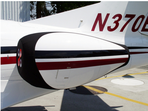
Bikini style Engine Covers