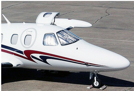
Eclipse Cockpit Heatshields

Cockpit Heatshields are interior sunshades for the aircraft's cockpit. The product is a unique composite of closed-cell foam with a silver mylar finish. The semi-rigid design is stiff enough to stand inside the window framing. The set folds up flat and is easily stored in the included storage sleeve. Some designs may require velcro and suction cups. Our Heatshields for jets are offered white side out because some aircraft manufacturers have issued advisories against reflective window inserts due to potential heat damage. A Heatshield is an excellent short-term remedy for cockpit overheating, but an external fabric cover is more effective for long-term protection.