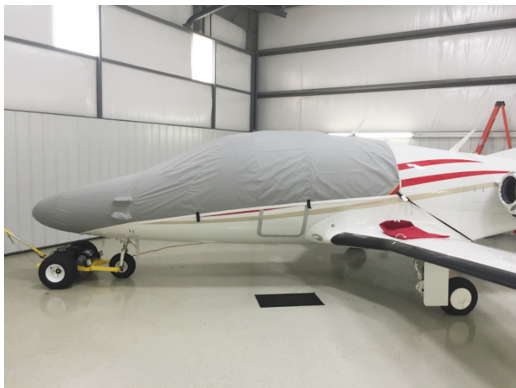
Eclipse Travel Weight Canopy/Nose Cover