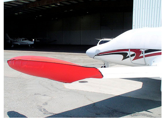
Eclipse Tip Tank Cover