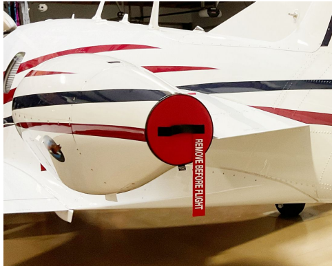
Eclipse EA500 Intake/Exhaust Plugs