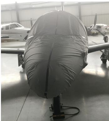
Eclipse EA550 Travel Canopy/Nose Cover

This cover type is made from Silver Acrylic Sunbrella canvas and is 100% lined with a soft and smooth microfiber. Bruce's Custom Covers developed this material combination especially for aircraft protection. The outer material is medium weight and treated for water resistance, UV resistance and anti-static buildup. The inner lining is a very soft and smooth microfiber to prevent scratching. The material is very reflective, and tests show that the cabin interior temperature can be reduced to near-ambient temperature on the hottest of days. It is water, ice and snow repellent, yet breathable to allow moisture to escape from between the cover and the aircraft surface.