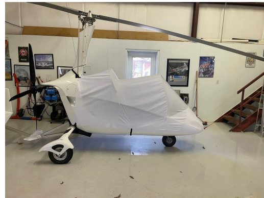
MTO Sport Gyrocopter Canopy/Nose Cover, test fit cover