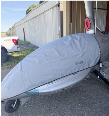
ELA Eclipse EVO Canopy/Nose Cover

The Engine Inlet Plugs are custom fit for your ELA Aviation Eclipse, Cougar, Scorpion Gyrocopter intakes, made with heavy-duty vinyl material, and stuffed with a single block of sculpted urethane foam. Each plug has a zipper that allows the foam to be removed and dried if necessary. Engine plugs have 'Remove Before Flight' streamers sewn onto the face of the plugs. Most plugs are imprinted with the aircraft registration number in black for an extra charge. Storage bag NOT included. Engine plugs may be inserted after flight when the engine is still warm. Engine Inlet Plugs are commonly referred to as Cowl Plugs, Intake Plugs, Cowl Blocks, Engine Blocks, and Engine Bunges.