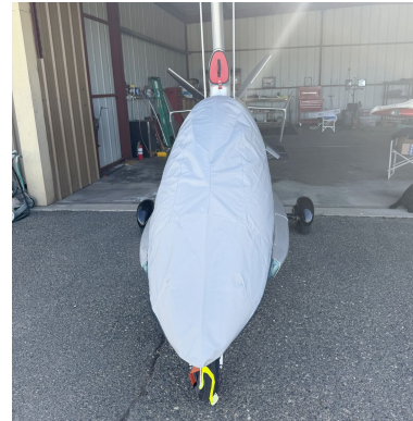
ELA Eclipse EVO Canopy/Nose Cover