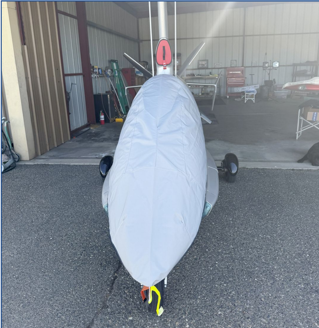
ELA Eclipse EVO Canopy/Nose Cover