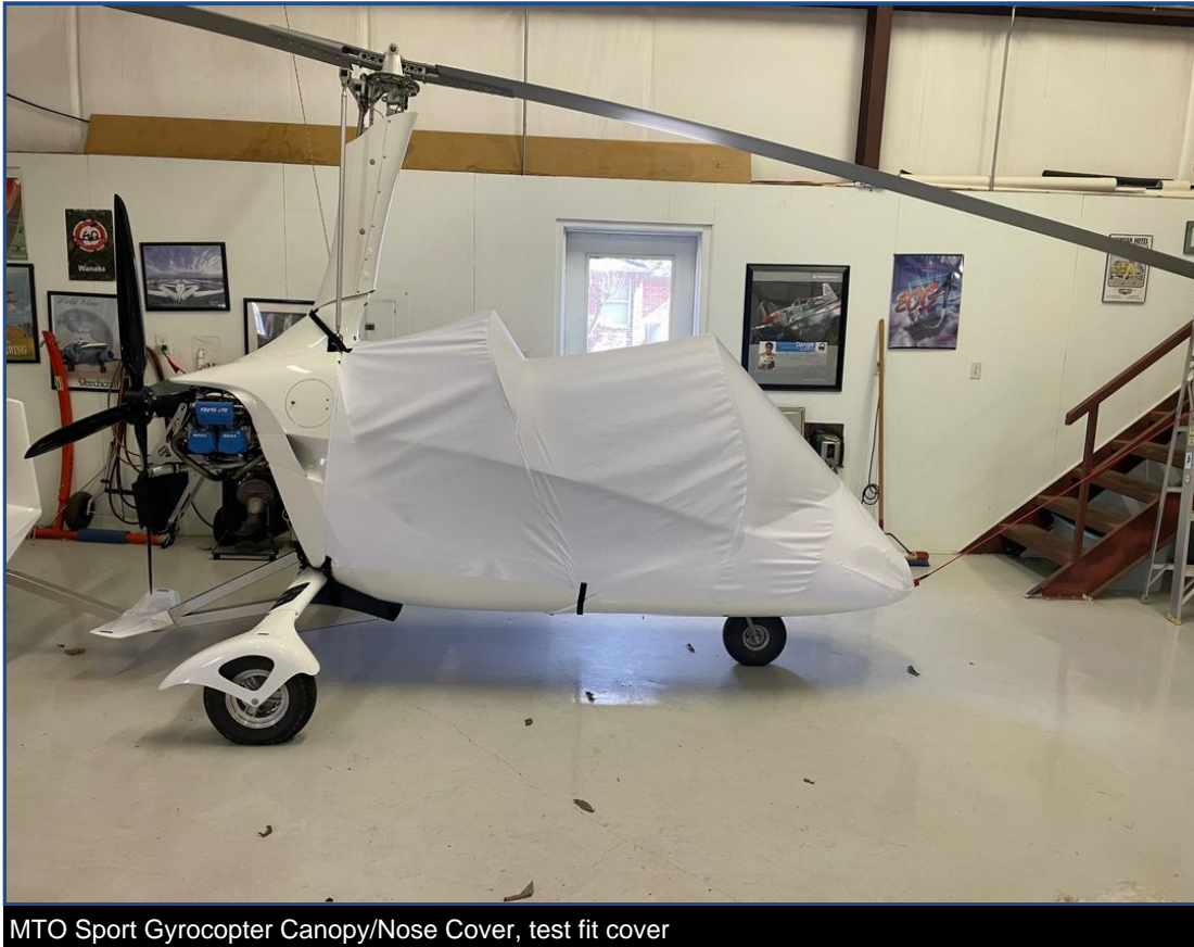
MTO Sport Gyrocopter Canopy/Nose Cover, test fit cover