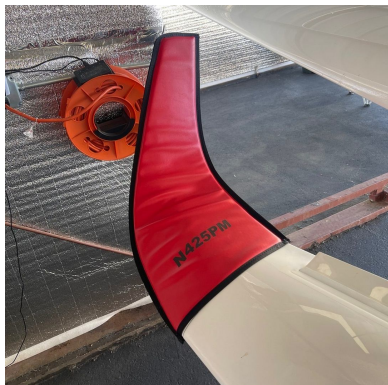
Stemme S-10 & S-12 Wingtip Pads

Designed to prevent damage to the wingtip in crowded hangars or high traffic areas, these products are made of bright red Naugahyde and thickly padded with a sandwich of closed cell foam. Protects delicate winglets, casters and their housings, and soft finishes.