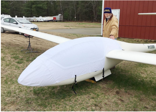
Grob 102 Astir CS Canopy/Nose Cover (test fit)