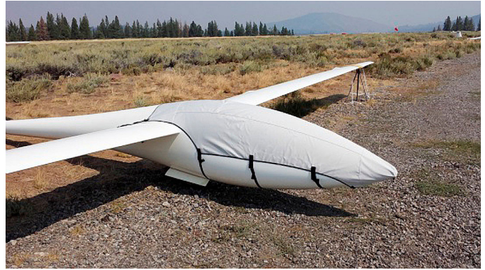
ASW-20C Canopy/Nose Cover