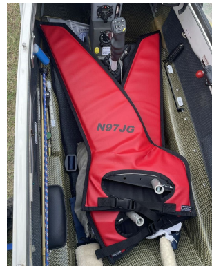
Schemp-Hirth Ventus-2B winglet/wingtip pads