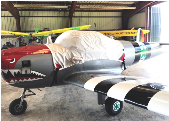
Ercoupe Canopy Cover (Bubble Windshield Model)

This cover type is made from Silver Acrylic Sunbrella canvas and is 100% lined with a soft and smooth microfiber. Bruce's Custom Covers developed this material combination especially for aircraft protection. The outer material is medium weight and treated for water resistance, UV resistance and anti-static buildup. The inner lining is a very soft and smooth microfiber to prevent scratching. The material is very reflective, and tests show that the cabin interior temperature can be reduced to near-ambient temperature on the hottest of days. It is water, ice and snow repellent, yet breathable to allow moisture to escape from between the cover and the aircraft surface.