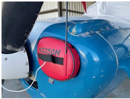
Ercoupe Engine Plugs