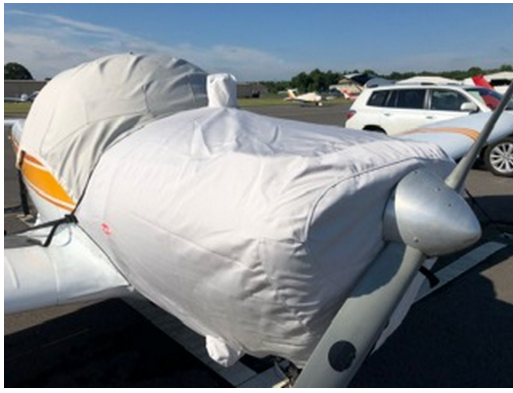
Ercoupe 415-C Fully Enclosed Engine Cover