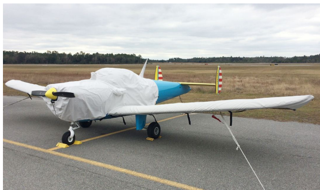
Ercoupe Extended Canopy/Engine Cover, and Wing Covers

WINTER USE MATERIAL - Made with Solution-Dyed Polyester fabric, this option is intended for seasonal use to aid in deicing, rain mitigation, or for occasional travel. The material is lighter and more compact, but more susceptible to UV damage and may have a shorter useful life if used continuously outside than the all-year use material.