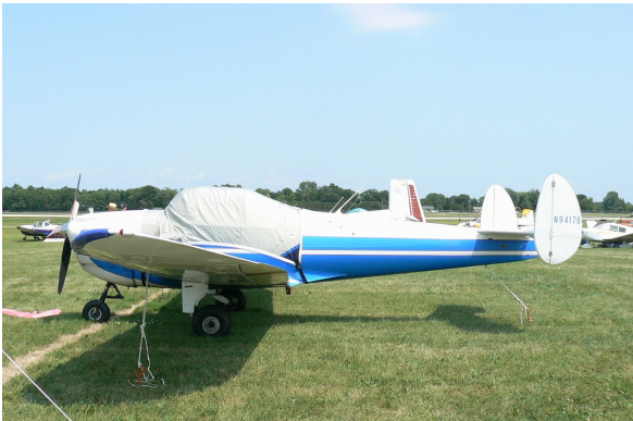
Ercoupe Canopy Cover, flat windshield model