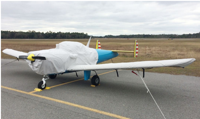
Ercoupe Extended Canopy/Engine Cover, and Wing Covers