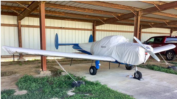
Ercoupe 415-C Wing Covers, All Year Use(set of 2)

WINTER USE MATERIAL - Made with Solution-Dyed Polyester fabric, this option is intended for seasonal use to aid in deicing, rain mitigation, or for occasional travel. The material is lighter and more compact, but more susceptible to UV damage and may have a shorter useful life if used continuously outside than the all-year use material.