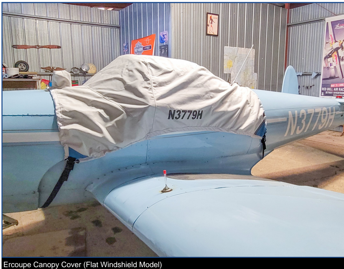
Ercoupe Canopy Cover (Flat Windshield Model)