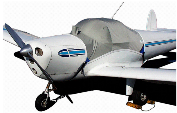
Ercoupe Canopy Cover, bubble windshield model