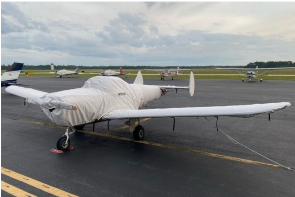
Ercoupe Complete Cover Set