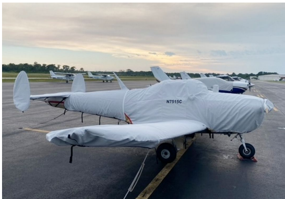
Ercoupe Complete Cover Set

WINTER USE MATERIAL - Made with Solution-Dyed Polyester fabric, this option is intended for seasonal use to aid in deicing, rain mitigation, or for occasional travel. The material is lighter and more compact, but more susceptible to UV damage and may have a shorter useful life if used continuously outside than the all-year use material.