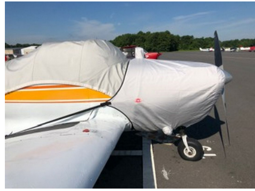
Ercoupe 415-C Fully Enclosed Engine Cover