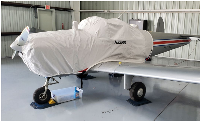
Ercoupe 415-C Extended Canopy/Engine Cover

This cover type is made from Silver Acrylic Sunbrella canvas and is 100% lined with a soft and smooth microfiber. Bruce's Custom Covers developed this material combination especially for aircraft protection. The outer material is medium weight and treated for water resistance, UV resistance and anti-static buildup. The inner lining is a very soft and smooth microfiber to prevent scratching. The material is very reflective, and tests show that the cabin interior temperature can be reduced to near-ambient temperature on the hottest of days. It is water, ice and snow repellent, yet breathable to allow moisture to escape from between the cover and the aircraft surface.