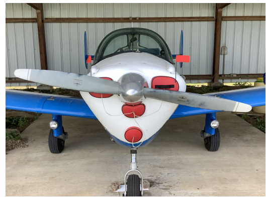
Ercoupe Engine Inlet Plugs