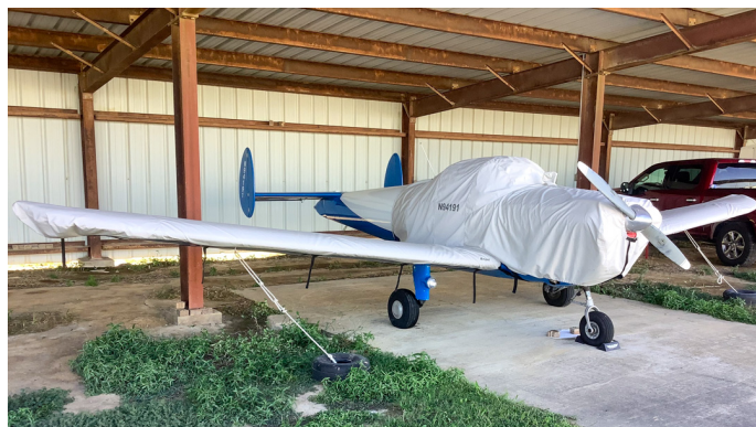
Ercoupe 415-C Wing Covers, All Year Use(set of 2)