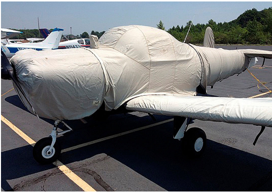
Ercoupe full cover set: Extended Canopy, Engine, Wing & Empennage covers