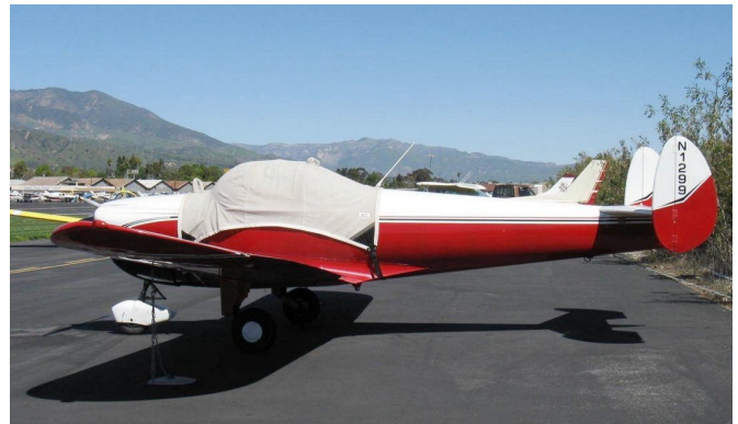
Ercoupe Canopy Cover