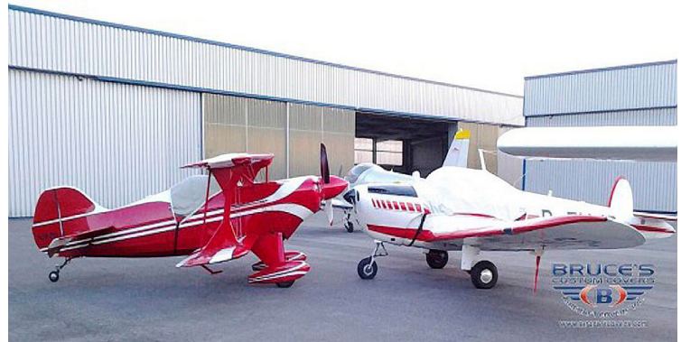
Pitts & Ercoupe Canopy Covers