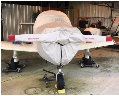
Ercoupe Extended Canopy/Engine & Prop Cover