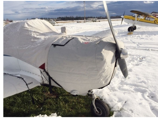
Ercoupe Insulated Engine Cover