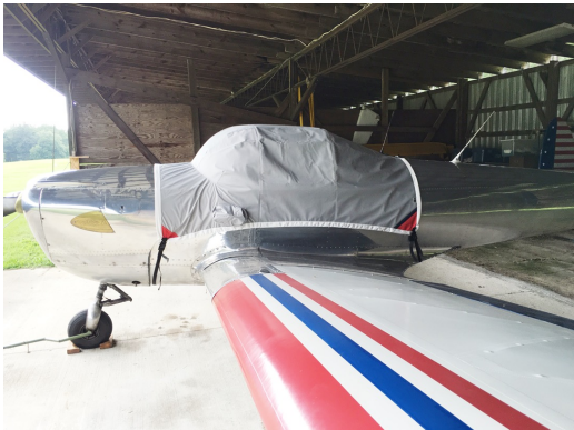
Ercoupe Light Weight Travel Cover

Travel Covers are made with Silver Solution-Dyed Polyester fabric and only lined over the windshield to save weight. The material is lightweight and more compact for easy stowage in the aircraft. The polyester material is water resistant, but only intended for occasional use outside. We also have an ultra lightweight material available for fitted hangar dust covers. For daily outdoor use, the non-travel Sunbrella Cover is the best choice.