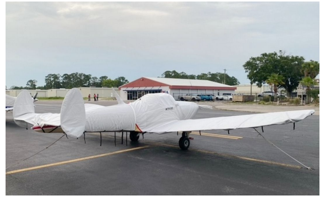
Ercoupe Complete Cover Set