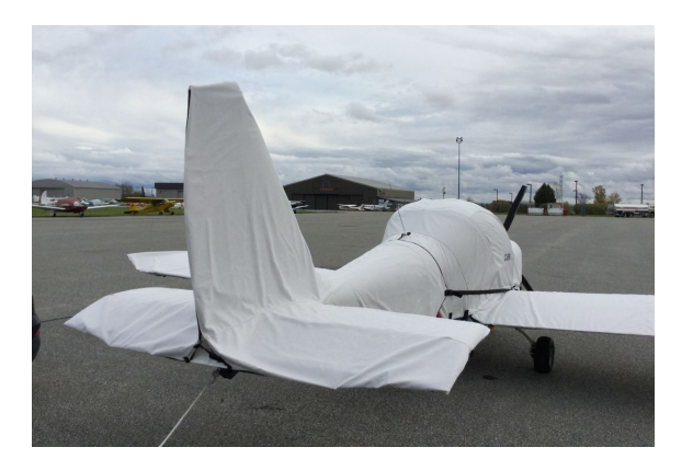
Evektor Sportstar Full Cover Set