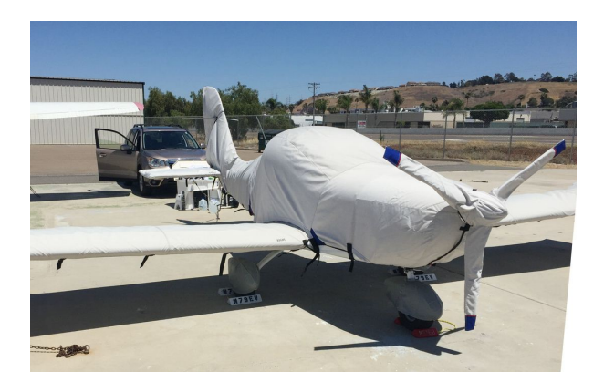
2017 Evector Sportstar Max Extended Canopy/Engine Cover