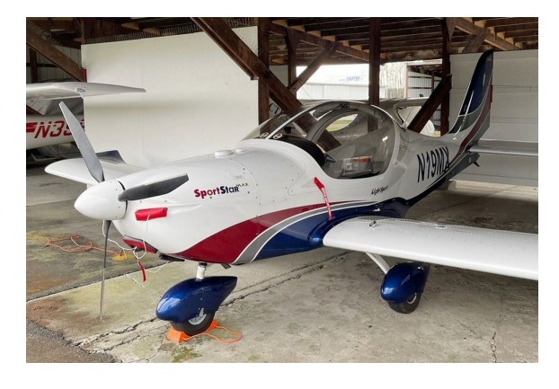
Evektor SportStar Engine & Vent Plugs

Engine Inlet Plugs are custom fit for your Evektor-Aerotechnik SportStar, Eurostar, Max, Harmony intakes, made with heavy-duty vinyl material, and stuffed with a single block of sculpted urethane foam. Each plug has a zipper that allows the foam to be removed and dried if necessary. Engine plugs have warning flags that are visible from the cockpit or 'remove before flight' streamers sewn onto the face of the plugs. Most plugs are imprinted with the aircraft registration number in black for an extra charge. Storage bag NOT included. Engine plugs may be inserted after flight when the engine is still warm. Engine Inlet Plugs are commonly referred to as Cowl Plugs, Intake Plugs, Cowl Blocks, Engine Blocks, and Engine Bungs.