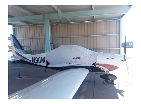
Evektor Sportstar Max Canopy Cover

This cover type is made from Silver Acrylic Sunbrella canvas and is 100% lined with a soft and smooth microfiber. Bruce's Custom Covers developed this material combination especially for aircraft protection. The outer material is medium weight and treated for water resistance, UV resistance and anti-static buildup. The inner lining is a very soft and smooth microfiber to prevent scratching. The material is very reflective, and tests show that the cabin interior temperature can be reduced to near-ambient temperature on the hottest of days. It is water, ice and snow repellent, yet breathable to allow moisture to escape from between the cover and the aircraft surface.