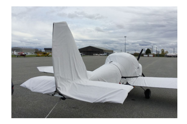
Evektor Sportstar Full Cover Set