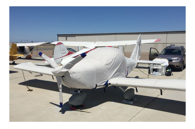
2017 Evector Sportstar Max All Year Use Wing Covers