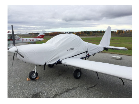
Evektor Sportstar Full Cover Set

shorter useful life if used continuously outside than the all-year use material.