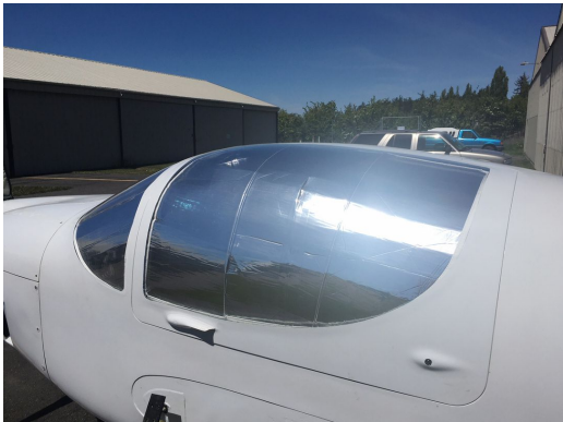
Europa Cabin HeatShields

Heatshields are interior sunshades for an aircraft's windows or canopy glass. The product is a unique composite of closed-cell foam with a silver mylar finish. The semi-rigid design is stiff enough to stand along the inside of the windshield using sun visors or window framing. It folds up flat and easily stores in the included storage sleeve. Some designs may require velcro and suction cups. A Heatshield is an excellent short-term remedy for cockpit overheating.