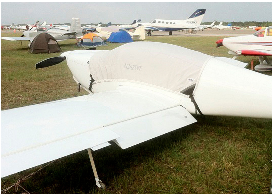
Europa XS Canopy Cover