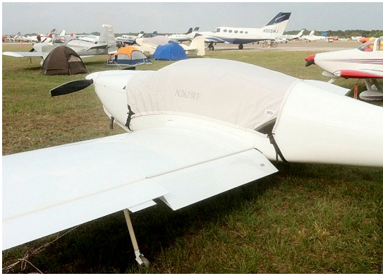
Europa XS Canopy Cover