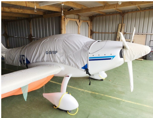
Europa Canopy Cover

The Europa All Europa Models Canopy/Engine Cover is a one-piece cover (100% lined with microfiber) that is a combination of the Canopy Cover and Engine Cover. This cover will enclose the engine cowl and will extend aft to cover all of the windows. This cover type is made from Silver Acrylic Sunbrella canvas and is 100% lined with a soft and smooth microfiber. Bruce's Custom Covers developed this material combination especially for aircraft protection. The outer material is medium weight and treated for water resistance, UV resistance and anti-static buildup. The inner lining is a very soft and smooth microfiber to prevent scratching. The material is very reflective, and tests show that the cabin interior temperature can be reduced to near-ambient temperature on the hottest of days. It is water, ice and snow repellent, yet breathable to allow moisture to escape from between the cover and the aircraft surface.