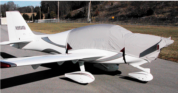
Canopy/Engine and Prop/Spinner Covers (tri-gear model)

This cover type is made from Silver Acrylic Sunbrella canvas and is 100% lined with a soft and smooth microfiber. Bruce's Custom Covers developed this material combination especially for aircraft protection. The outer material is medium weight and treated for water resistance, UV resistance and anti-static buildup. The inner lining is a very soft and smooth microfiber to prevent scratching. The material is very reflective, and tests show that the cabin interior temperature can be reduced to near-ambient temperature on the hottest of days. It is water, ice and snow repellent, yet breathable to allow moisture to escape from between the cover and the aircraft surface.