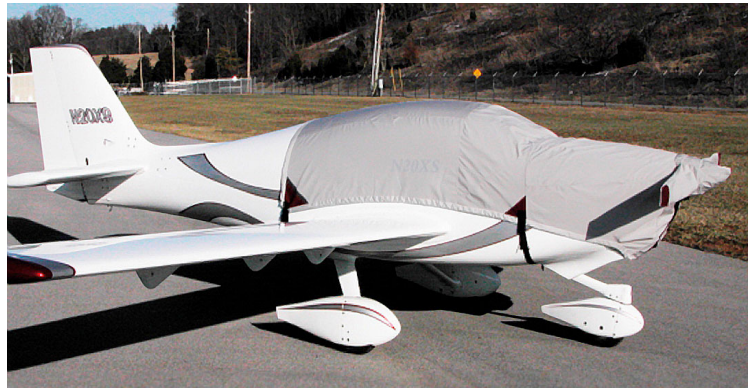
Canopy/Engine and Prop/Spinner Covers (tri-gear model)