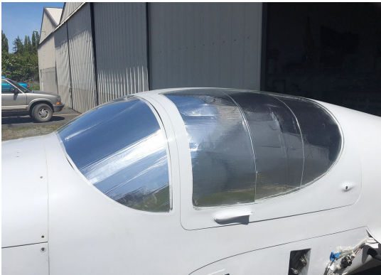
Europa Cabin HeatShields