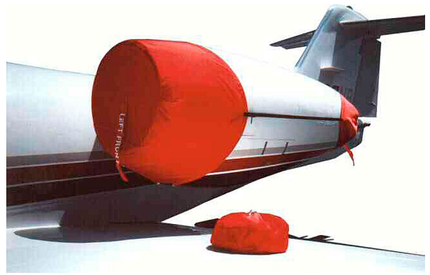
Lear 30 Tri-Fold Engine Cover