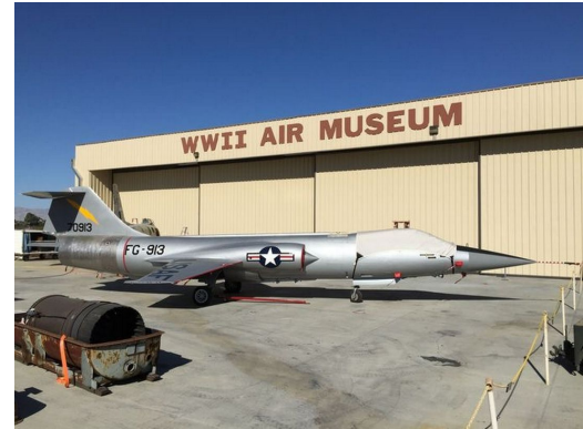
Lockheed F-104 Starfighter Canopy Cover, Single Seat Model