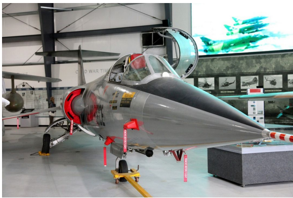
Lockheed F-104 Starfighter Intake Plugs