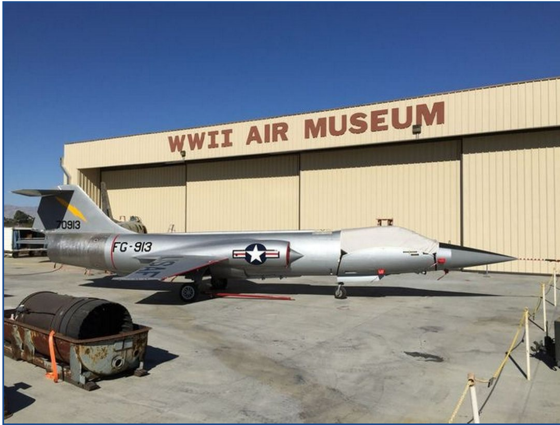
Lockheed F-104 Starfighter Canopy Cover, Single Seat Model