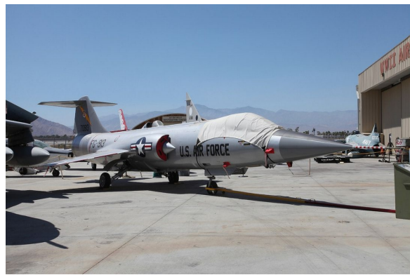
Lockheed F104 Canopy Cover, Intake Plugs