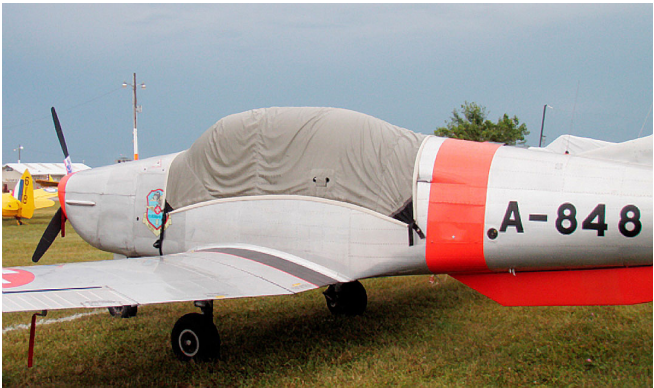
Piaggio P-149D Trainer Canopy Cover