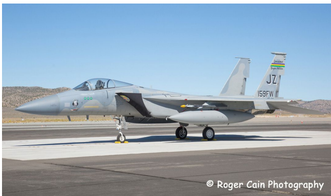
McDonnell-Douglas F-15 Intake Covers

The McDonnell Douglas F-15 Eagle Intake Covers are designed to install easily yet be completely storable. A spring steel hoop is sewn into the hem of each cover, allowing them to be installed without climbing onto the wing or using a stepladder. To store the covers the spring steel hoop folds like a band-saw blade into three nesting rings. Each cover folds into a compact circular bundle which is stored in the included duffle bag, yet they unfold quickly for use. The Tri-Fold Ring cover is made of medium weight nylon which is available in a variety of colors to match the paint trim. Each cover set comes complete with installation and folding instructions. The aircraft's registration number can be silkscreened onto the cover for an extra charge.