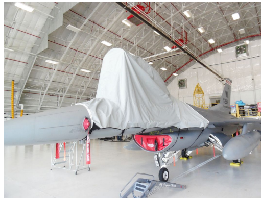
F-16 CANOPY COVER, OPEN POSITION (C-Model, single seat models)