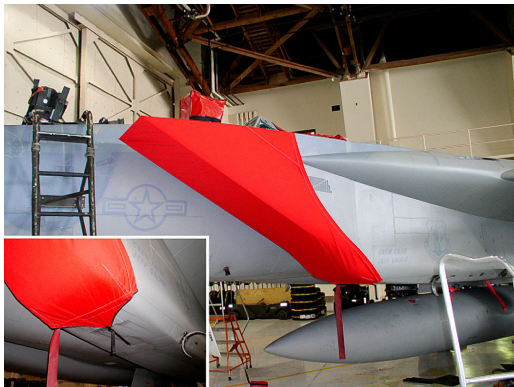
Intake Cover, Attachment Detail (inset)

The McDonnell Douglas F-15 Eagle Intake Covers are designed to install easily yet be completely storable. A spring steel hoop is sewn into the hem of each cover, allowing them to be installed without climbing onto the wing or using a stepladder. To store the covers the spring steel hoop folds like a band-saw blade into three nesting rings. Each cover folds into a compact circular bundle which is stored in the included duffel bag, yet they unfold quickly for use. The Tri-Fold Ring cover is made of medium weight nylon which is available in a variety of colors to match the paint trim. Each cover set comes complete with installation and folding instructions. The aircraft's registration number can be silkscreened onto the cover for an extra charge.