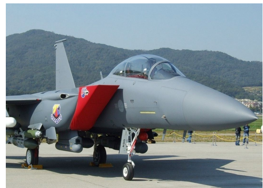
McDonnell Douglas F-15 Eagle Engine Inlet Covers