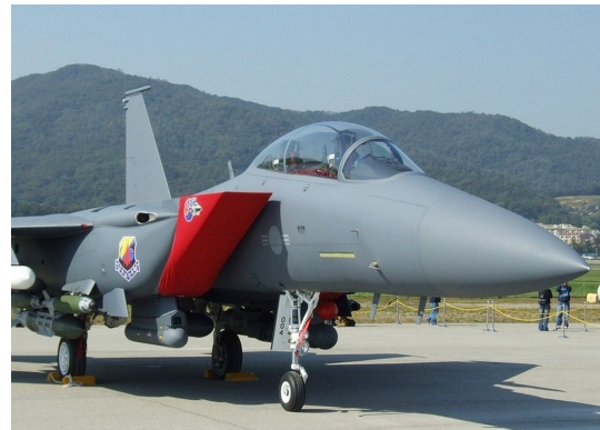
McDonnell Douglas F-15 Eagle Engine Inlet Covers