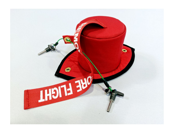
General Dynamics F-16 AOA Probe Cover