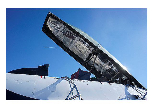
F-16 Cockpit HeatShields