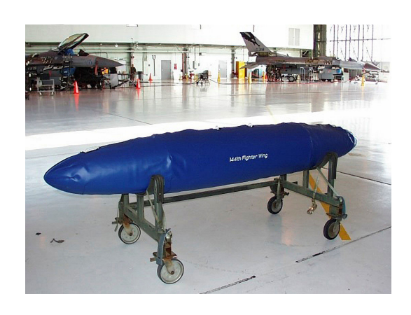
F-16 Cargo Pod Cover, similar to the Centerline Fuel Tank Cover