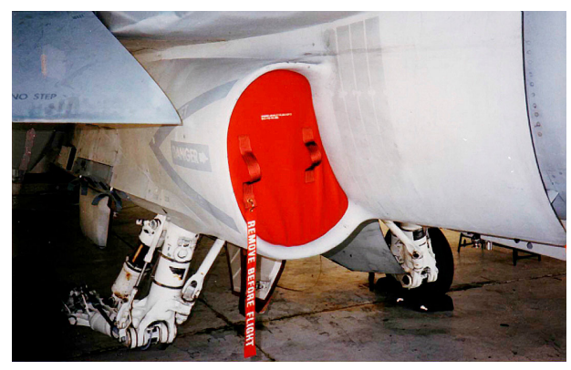
Engine Inlet Plug