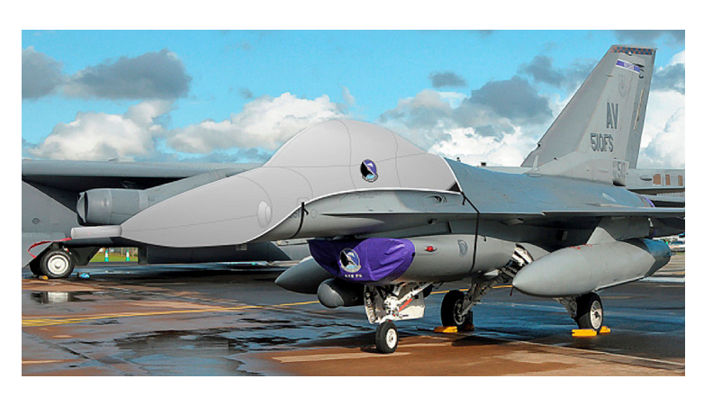
F-16 Canopy/Nose Cover