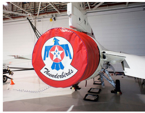
F-16 Radome, Pitot, Air Data Probe Cover, Intake Cover, HUD Cover, Seat Cover

The General Dynamics F-16 Fighting Falcon Intake Covers are designed to install easily yet be completely storable. A spring steel hoop is sewn into the hem of each cover, allowing them to be installed without climbing onto the wing or using a stepladder. To store the covers the spring steel hoop folds like a band-saw blade into three nesting rings. Each cover folds into a compact circular bundle which is stored in the included duffle bag, yet they unfold quickly for use. The Tri-Fold Ring cover is made of medium weight nylon which is available in a variety of colors to match the paint trim. Each cover set comes complete with installation and folding instructions. The aircraft's registration number can be silkscreened onto the cover for an extra charge.