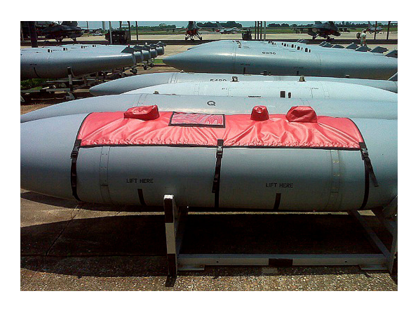
300 gal. CENTERLINE FUEL TANK PYLON COVER, with/without forms pouch