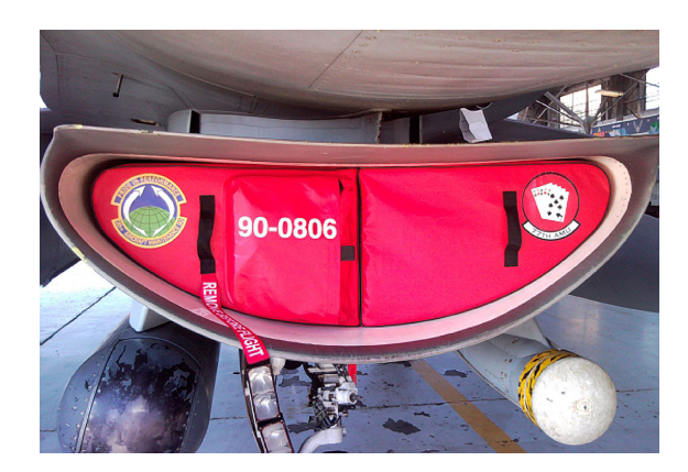
F-16 Folding Intake Plug with Forms Pouch and Custom Artwork

The Engine Inlet Plugs are custom fit for your General Dynamics F-16 Fighting Falcon intakes, made with heavy-duty vinyl material, and stuffed with a single block of sculpted urethane foam. Each plug has a zipper that allows the foam to be removed and dried if necessary. Engine plugs have 'remove before flight' streamers sewn onto the face of the plugs. Most plugs are imprinted with the aircraft registration number in black for an extra charge. Storage bag NOT included. Engine plugs may be inserted after flight when the engine is still warm. Engine Inlet Plugs are commonly referred to as Cowl Plugs, Intake Plugs, Cowl Blocks, Engine Blocks, and Engine Bungs.