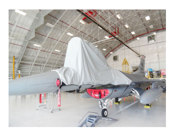
F-16 CANOPY COVER, OPEN POSITION (C-Model, single seat F-16 CANOPY COVER, OPEN POSITION (C-Model, single seat models)