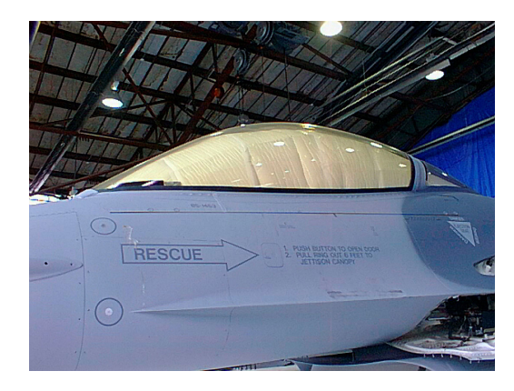
General Dynamics F-16 Cockpit HeatShields

Cockpit Heatshields are interior sunshades for the aircraft's cockpit. The product is a unique composite of closed-cell foam with a silver mylar finish. The semi-rigid design is stiff enough to stand inside the window framing. The set folds up flat and is easily stored in the included storage sleeve. Some designs may require velcro and suction cups. Our Heatshields for jets are offered white side out because some aircraft manufacturers have issued advisories against reflective window inserts due to potential heat damage. A Heatshield is an excellent short-term remedy for cockpit overheating, but an external fabric cover is more effective for long-term protection.