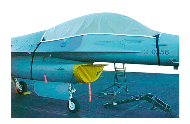
Canopy Cover, F-16

Travel Covers are made with Silver Solution-Dyed Polyester fabric and only lined over the windshield to save weight. The material is lightweight and more compact for easy stowage in the aircraft. The polyester material is water resistant, but only intended for occasional use outside. We also have an ultra lightweight material available for fitted hangar dust covers. For daily outdoor use, the non-travel Sunbrella Cover is the best choice.