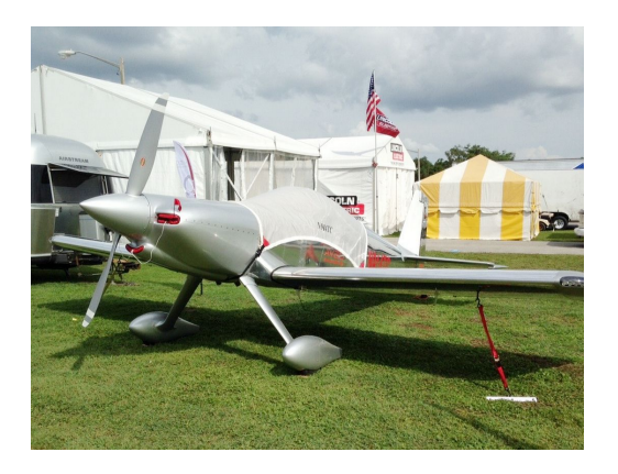
F1 Rocket Canopy Cover, Engine Plugs

Engine Inlet Plugs are custom fit for your Team Rocket F1 Rocket, F4 Raider intakes, made with heavy-duty vinyl material, and stuffed with a single block of sculpted urethane foam. Each plug has a zipper that allows the foam to be removed and dried if necessary. Engine plugs have warning flags that are visible from the cockpit or 'remove before flight' streamers sewn onto the face of the plugs. Most plugs are imprinted with the aircraft registration number in black for an extra charge. Storage bag NOT included. Engine plugs may be inserted after flight when the engine is still warm. Engine Inlet Plugs are commonly referred to as Cowl Plugs, Intake Plugs, Cowl Blocks, Engine Blocks, and Engine Bungs.