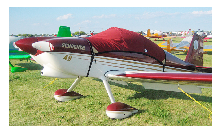
F1 Rocket Canopy Cover