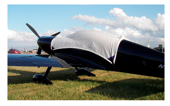
F1 Rocket Canopy Cover

This cover type is made from Silver Acrylic Sunbrella canvas and is 100% lined with a soft and smooth microfiber. Bruce's Custom Covers developed this material combination especially for aircraft protection. The outer material is medium weight and treated for water resistance, UV resistance and anti-static buildup. The inner lining is a very soft and smooth microfiber to prevent scratching. The material is very reflective, and tests show that the cabin interior temperature can be reduced to near-ambient temperature on the hottest of days. It is water, ice and snow repellent, yet breathable to allow moisture to escape from between the cover and the aircraft surface.