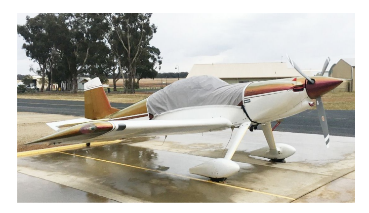
F1 Rocket Travel Cover, Light Weight Travel Canopy Cover, Bubble Windshield, Engine Plugs