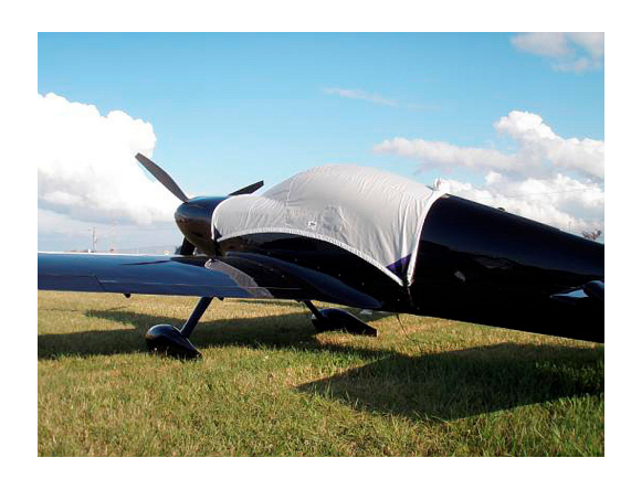
Harmon Rocket Canopy Cover & Engine Inlet Plugs