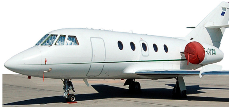
Falcon Engine Cover & Cockpit HeatShields