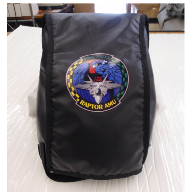
F-22 Raptor HUD Cover, padded