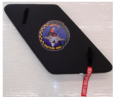
F-22 Raptor Engine Inlet Plug