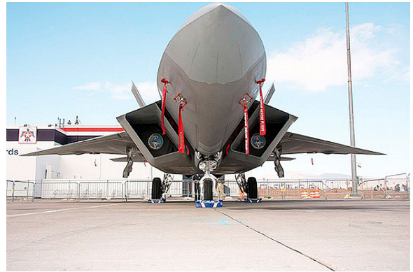
F-22 Raptor Engine Inlet Plugs Set