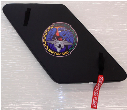
F-22 Raptor Engine Inlet Plug