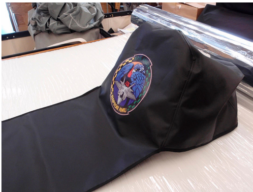
F22 Raptor Ejection Seat Maintenance Cover