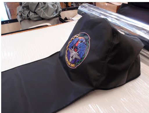
F22 Raptor Ejection Seat Maintenance Cover

The Engine Inlet Plugs are custom fit for your Lockheed Martin/Boeing F-22 Raptor intakes, made with heavy-duty vinyl material, and stuffed with a single block of sculpted urethane foam. Each plug has a zipper that allows the foam to be removed and dried if necessary. Engine plugs have 'remove before flight' streamers sewn onto the face of the plugs. Most plugs are imprinted with the aircraft registration number in black for an extra charge. Storage bag NOT included. Engine plugs may be inserted after flight when the engine is still warm. Engine Inlet Plugs are commonly referred to as Cowl Plugs, Intake Plugs, Cowl Blocks, Engine Blocks, and Engine Bungs.