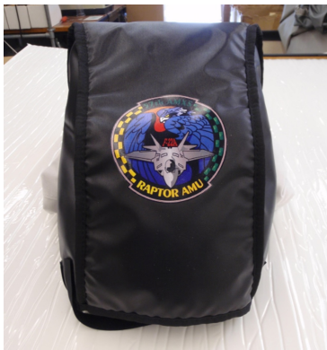
F-22 Raptor HUD Cover, padded