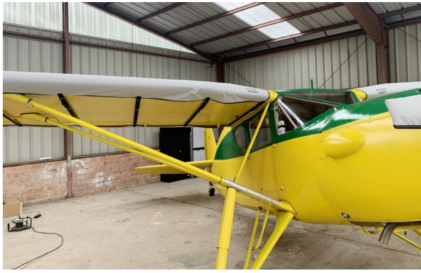
Fairchild 24 Wing Covers