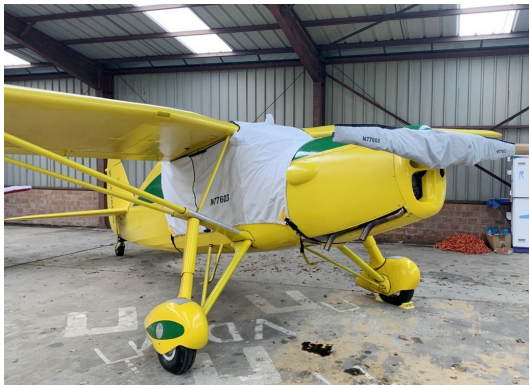
Fairchild 24 Over-Top Canopy Cover

Travel Covers are made with Silver Solution-Dyed Polyester fabric and only lined over the windshield to save weight. The material is lightweight and more compact for easy stowage in the aircraft. The polyester material is water resistant, but only intended for occasional use outside. We also have an ultra lightweight material available for fitted hangar dust covers. For daily outdoor use, the non-travel Sunbrella Cover is the best choice.