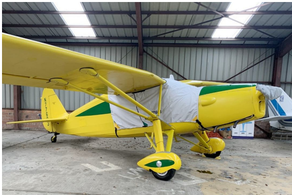
Fairchild 24 Over-Top Canopy Cover, Prop Cover