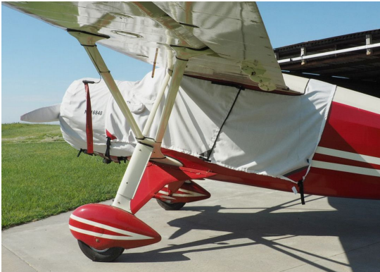
Fairchild 24W Canopy & Engine Cover

This cover type is made from Silver Acrylic Sunbrella canvas and is 100% lined with a soft and smooth microfiber. Bruce's Custom Covers developed this material combination especially for aircraft protection. The outer material is medium weight and treated for water resistance, UV resistance and anti-static buildup. The inner lining is a very soft and smooth microfiber to prevent scratching. The material is very reflective, and tests show that the cabin interior temperature can be reduced to near-ambient temperature on the hottest of days. It is water, ice and snow repellent, yet breathable to allow moisture to escape from between the cover and the aircraft surface.