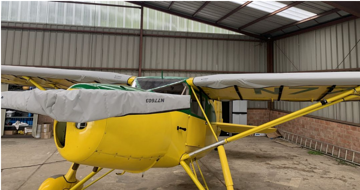
Fairchild 24 Wing & Prop Covers