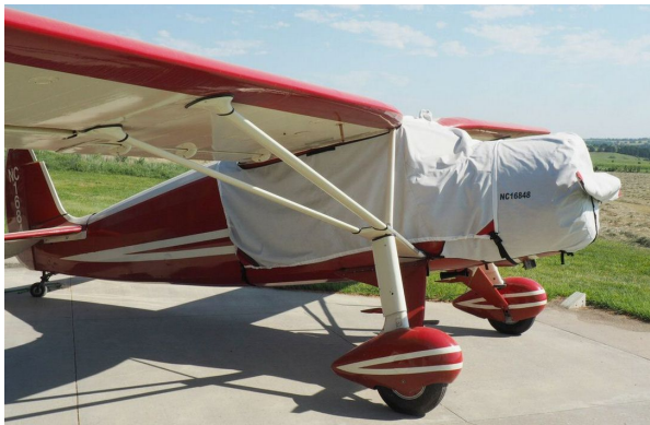
Fairchild 24W Canopy, Engine & Prop Cover

This cover type is made from Silver Acrylic Sunbrella canvas and is 100% lined with a soft and smooth microfiber. Bruce's Custom Covers developed this material combination especially for aircraft protection. The outer material is medium weight and treated for water resistance, UV resistance and anti-static buildup. The inner lining is a very soft and smooth microfiber to prevent scratching. The material is very reflective, and tests show that the cabin interior temperature can be reduced to near-ambient temperature on the hottest of days. It is water, ice and snow repellent, yet breathable to allow moisture to escape from between the cover and the aircraft surface.