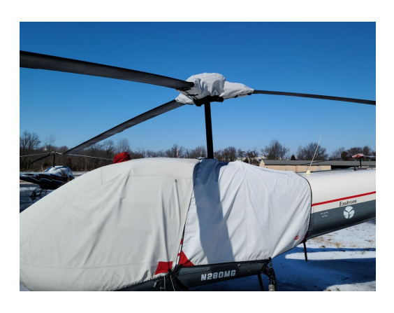
Enstrom 280C Shark Bubble, Engine & Rotor Hub Covers