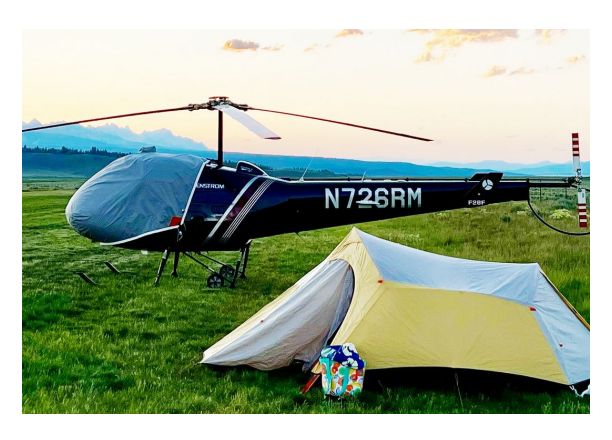
Enstrom F-28F Light Weigh Travel Bubble Cover

Travel Covers are made with Silver Solution-Dyed Polyester fabric and fully lined over the entire cover. The material is lightweight and more compact for easy stowage in the aircraft. The polyester material is water resistant, but only intended for occasional use outside. We also have an ultra lightweight material available for fitted hangar dust covers. For daily outdoor use, the non-travel Sunbrella Cover is the best choice.