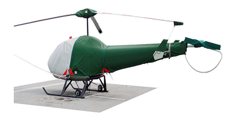
Enstrom 280FX Bubble, Engine, Tailboom, Main & Tail Rotor Covers