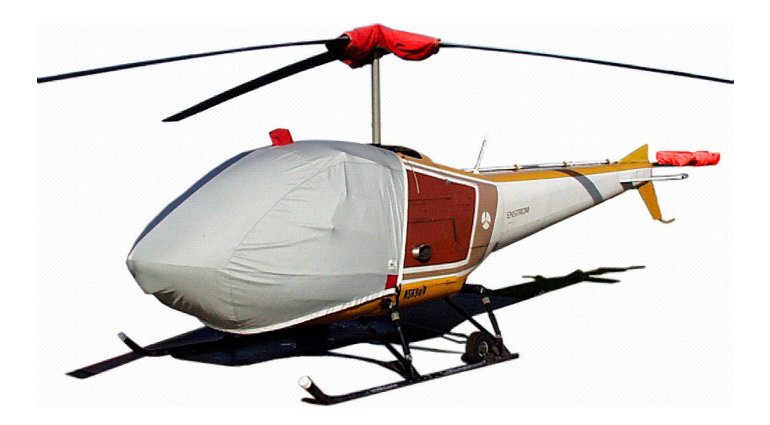
Enstrom 280FX Bubble, Main Rotor Mast, Tail Rotor Covers on Enstrom F280FX