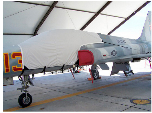
Northup F5 Talon Canopy Cover