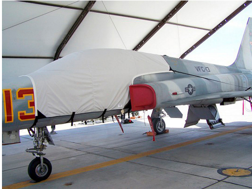
Northrup F5 Talon Canopy Cover

This cover type is made from Silver Acrylic Sunbrella canvas and is 100% lined with a soft and smooth microfiber. Bruce's Custom Covers developed this material combination especially for aircraft protection. The outer material is medium weight and treated for water resistance, UV resistance and anti-static buildup. The inner lining is a very soft and smooth microfiber to prevent scratching. The material is very reflective, and tests show that the cabin interior temperature can be reduced to near-ambient temperature on the hottest of days. It is water, ice and snow repellent, yet breathable to allow moisture to escape from between the cover and the aircraft surface.