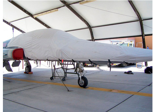
Northrup F5 Talon Canopy Cover