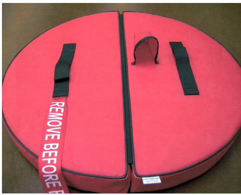
Falcon Center Engine Intake Plug