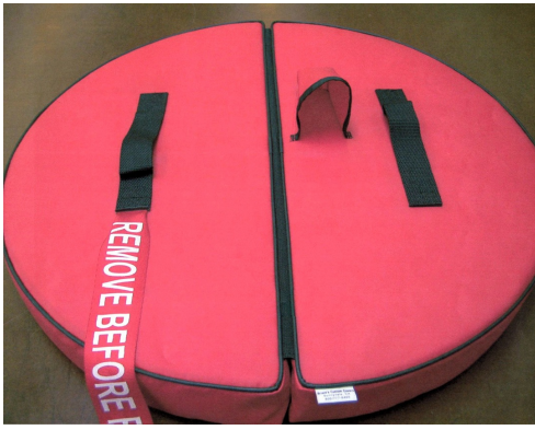
Falcon Center Engine Intake Plug