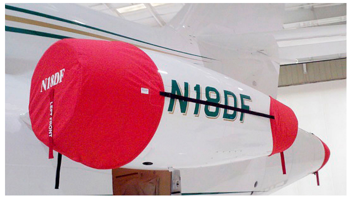
Falcon 900 Engine Cover Set