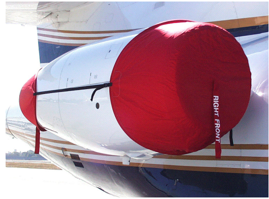
Falcon 50 Outboard Engine Cover